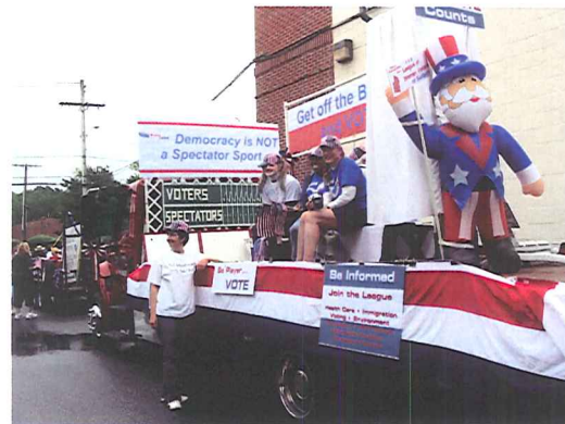
A League Fourth of July float

LWVMA has focused on many issues, including: election laws, natural resources, women’s health, children’s issues, civil rights, equal rights amendment, campaign finance reform, the open meeting law, state budget and finances, public education, gender equity, administration of justice, public safety, community preservation, casino gambling, redistricting, and many, many more.