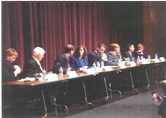
A Congressional Candidates' Night