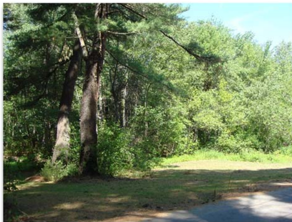
Above Right: An abandoned house on August Road. Left: The same lot after the house was removed.