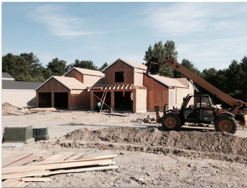
Left: Construction of a new home at Dudley Brook Preserve.

Summer construction is going strong in Sudbury. We have three residential subdivisions under construction with houses being built on Huckleberry Lane, Bostonian Way and Arboretum Way. It's been a while since we have seen this much single family construction at one time. The residential community, Dudley Brook Preserve at Tall Pine Drive, has 10 of its 26 units in different stages of construction, and the Coolidge is in the finishing stages.