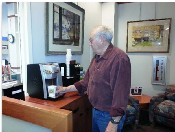
Above Left: The new "Browse & Brew" coffee station has comfortable seating and books on display.