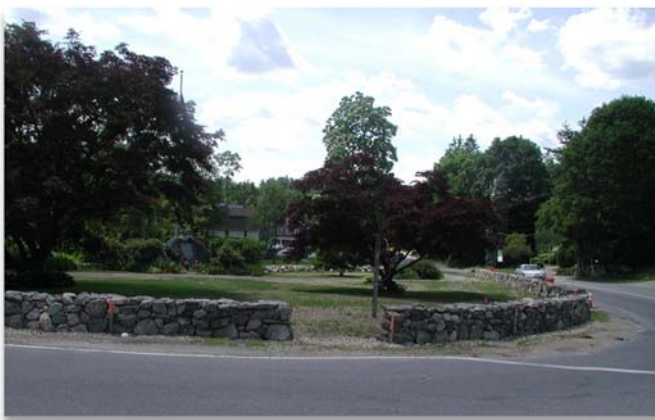
Above: Stone walls in Historic Sudbury Center

Under the Winter Rapid Recovery Road Program, $113,338.00 was released to the Town for repairs to roads. This money was used to resurface Elderberry Circle, Flintlock Lane, Musket Lane, Starview Drive and Woodmere Drive.