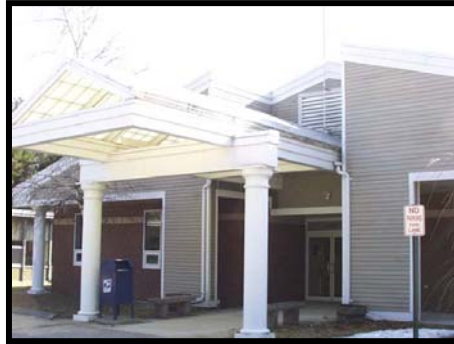
Sudbury Senior Center at the Fairbank Community Building