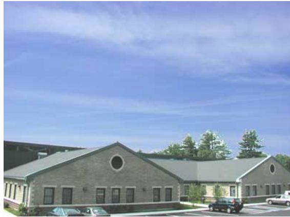
Public Works Building