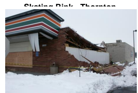
7-11 Store - Broomfield