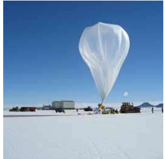
The balloon was launched from the Ross ice shelf on 28 December.