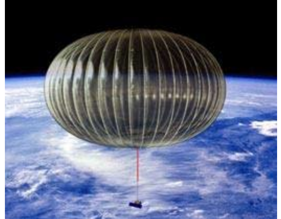
NASA is aiming for 100-day flights.

But 100-day flights are the stated goal for the style of balloon tested by this latest prototype. The paper-thin plastic skins that encompass these so-called 'super-pressure' balloons are sealed to the atmosphere. The pumpkin-shaped balloon withstands pressure differences caused by daily temperature swings with ribs or 'tendons' that stop it expanding. Most conventional balloons, shaped like those that carry people, are open to the atmosphere, and fluctuate in altitude like a sine wave as day turns to night. That has restricted long flights of conventional balloons to the constant daylight of polar summers. But even there, the balloons vary in altitude by thousands of metres — which can be a challenge for astronomers to account for.