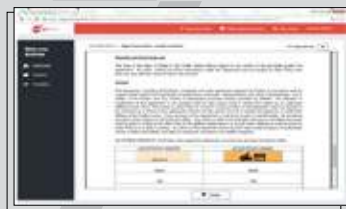
A signed signature filed