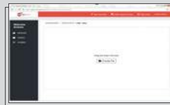
Upload a document to create a template