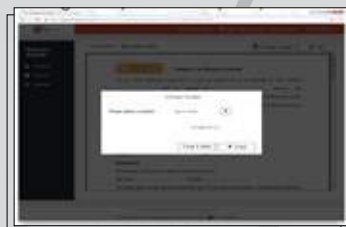
Choose a contact / add a phone number to send notification by SMS