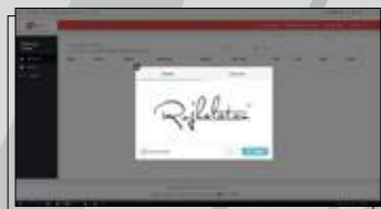
Sign Graphically or with a smart card