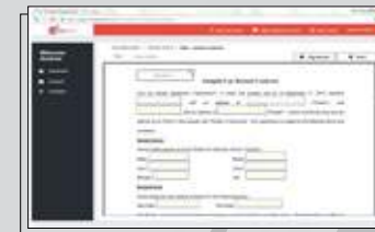
Drag & Drop signing fields to your document