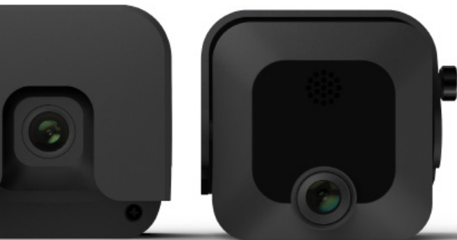
CM22 Dash Cam

The company promotes safe driving with dash cams, with the benefit of shielding both drivers and the company from liability in the case of an accident.