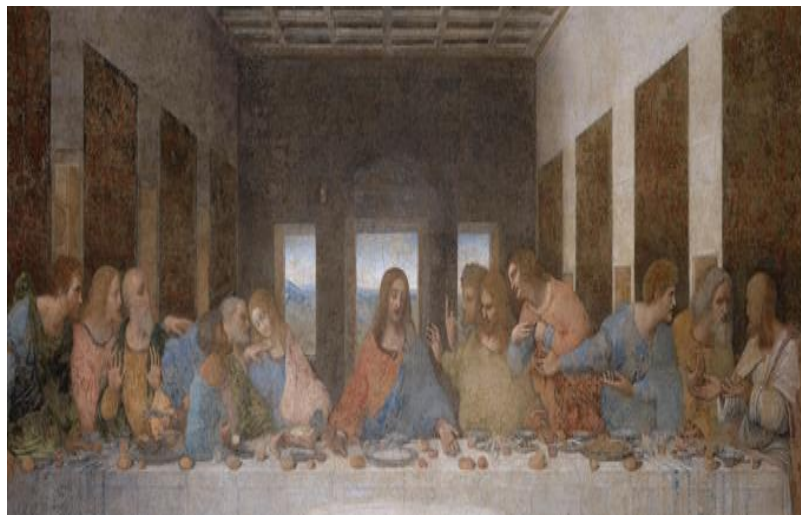
Figure 3. Leonardo Da Vinci, The Last Supper , 1498, tempera and oil on plaster, 15' 1" x 29' 0", Milan, Santa Maria delle Grazie. Accessed October 30, 2019. https://cenacolovinciano.vivaticket.it/index.php?wms_op=cenacoloVinciano .

The Last Supper by Leonardo Da Vinci is an example of classic art in which Christ is depicted with blond hair. The initial dark hair and beard became light or blond. The eyes became a light blue.