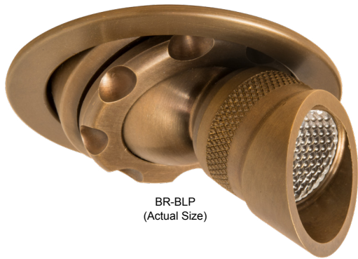
BR-BLP (Actual Size)

The down light version of Auroralight's new LSL6 is a Micro-Directional X-Platform IP67 luminaire that features a Thermally Integrated® and Field Serviceable LED module. The machined ball and socket design incorporates a remarkably small yet capable Cree® powered light engine. The easily replaceable, self-contained ball fits snugly into a precision machined socket for exceptional heat dissipation allowing this tiny luminaire to operate at 3 watts.