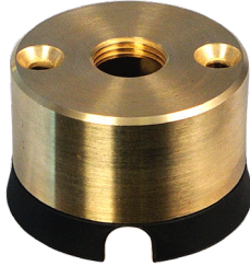
SCREW-IN TREE MOUNT

For easy and safe installation, you can pre-wire luminaires on the ground, and use the supplied stainless steel retention clip to hold connectors inside each brass fitting.