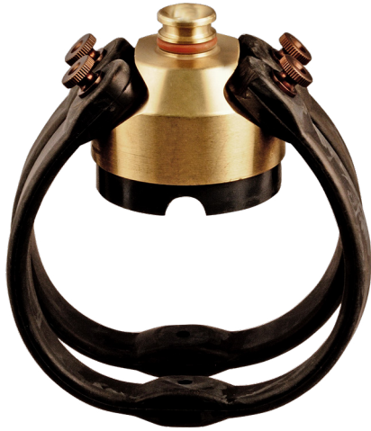
HEAVY DUTY TREE STRAP MOUNT (shown with AMS adapter)

Auroralight's Tree Mounts are machined from solid brass for durability and feature a nylon base with multiple wire exit ports. For use with 12V lighting systems.