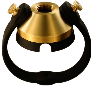
LIGHT DUTY TREE STRAP MOUNT (shown with 1/2" thread)

Auroralight's Tree Mounts are machined from solid brass for durability and feature a nylon base with multiple wire exit ports. For use with 12V lighting systems.