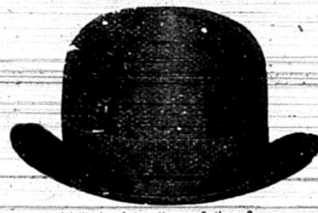
All Kinds of Sporting or College Caps.

Successor to E. T. Allen Co. Guns Fishing Tackle Tennis Golf, Gym Suits, Track Supplies, Cutlery, &c.