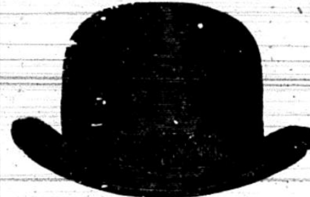
All Kinds of Sporting or College Caps.

GO TO C. HERRMANN & CO. THE ONLY MANUFACTURING HATTERS. 348 Kearny St., Near Pine (entire building)