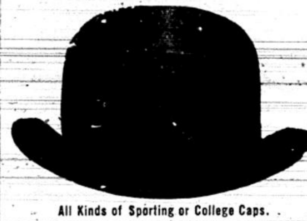
All Kinds of Sporting or College Caps.

C. HERRMANN & CO. THE ONLY MANUFACTURING HATTERS. 328 Kearny St., Near Pine (entire building)