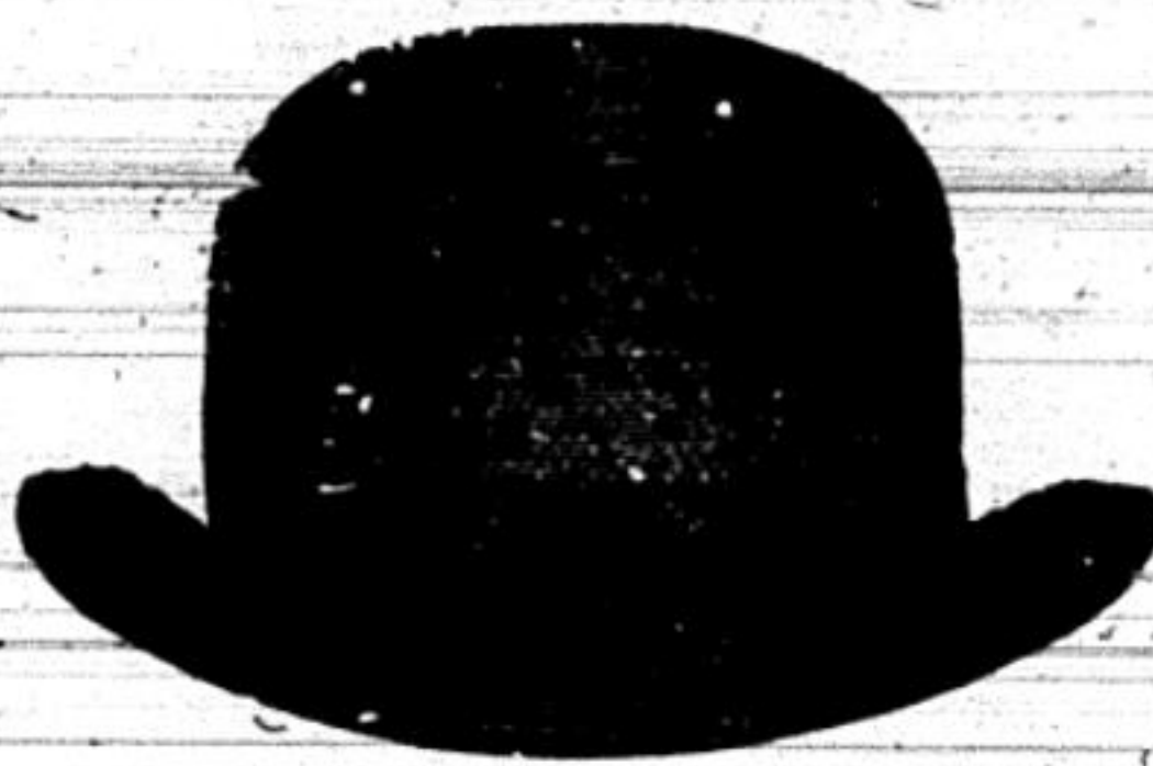
All Kinds of Sporting or College Caps.

Successor to E. T. Allen Co. Guns Fishing Tackle Tennis Golf, Gym Suits, Track Supplies, Cutlery, &c.