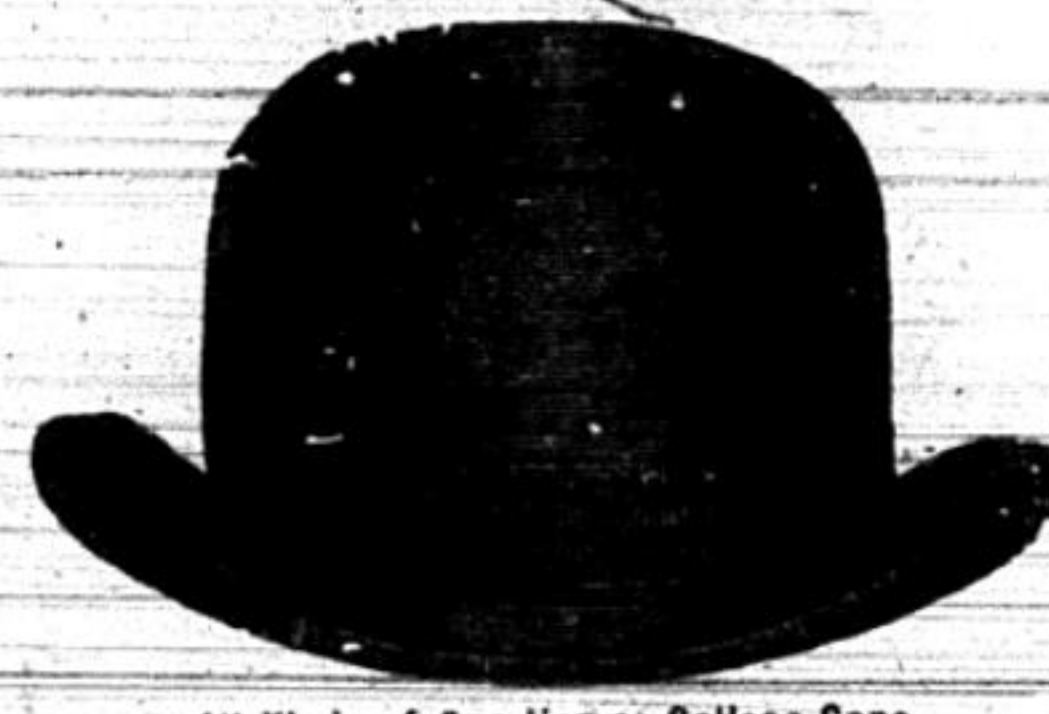
All Kinds of Sporting or College Caps.

Not every job done for U. C. but most of the good ones have our imprint on them. College work our delight.