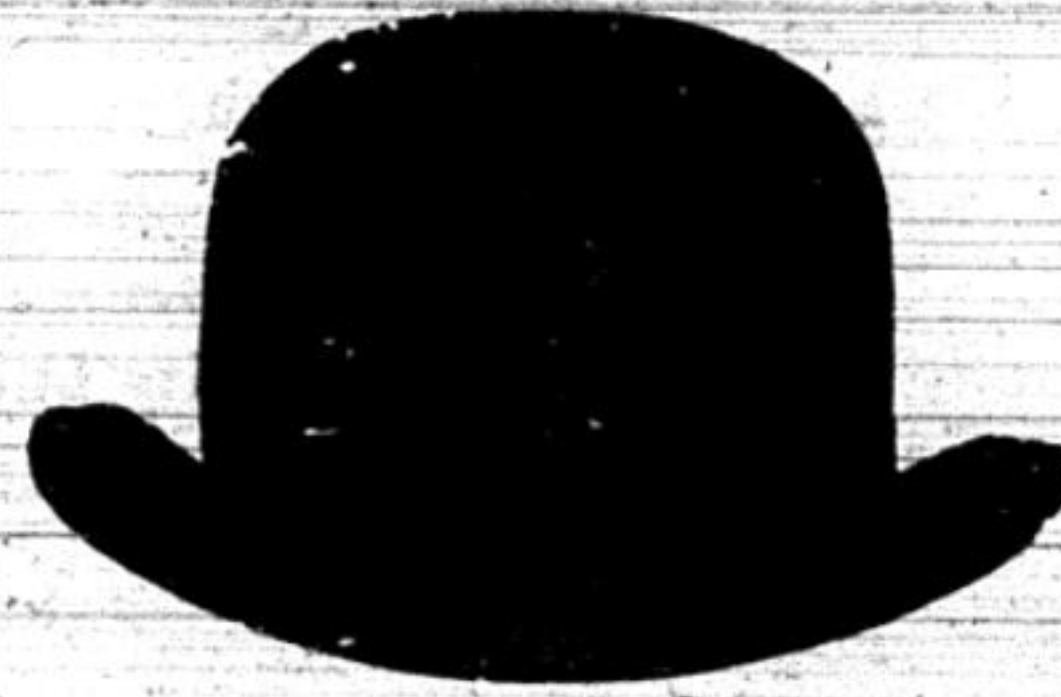
All Kinds of Sporting or Office Caps.

Not every job done for U. C. but most of the good ones have our imprint on them. College work our delight.