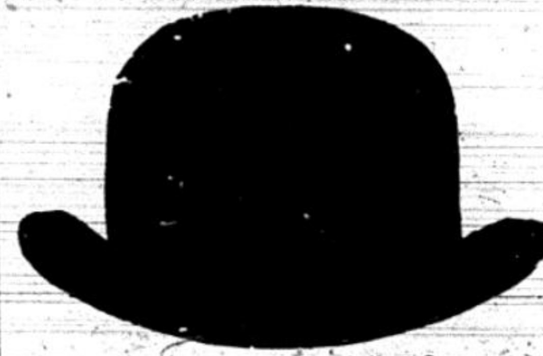
All Kinds of Sporting or College Caps.

Not every job done for U. C. but most of the good ones have our imprint on them. College work our delight.