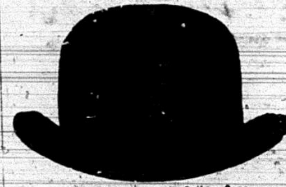
All kinds of Sporting & College Caps.

Not every job done for U. C. but most of the good ones have our imprint on them. College work our delight.