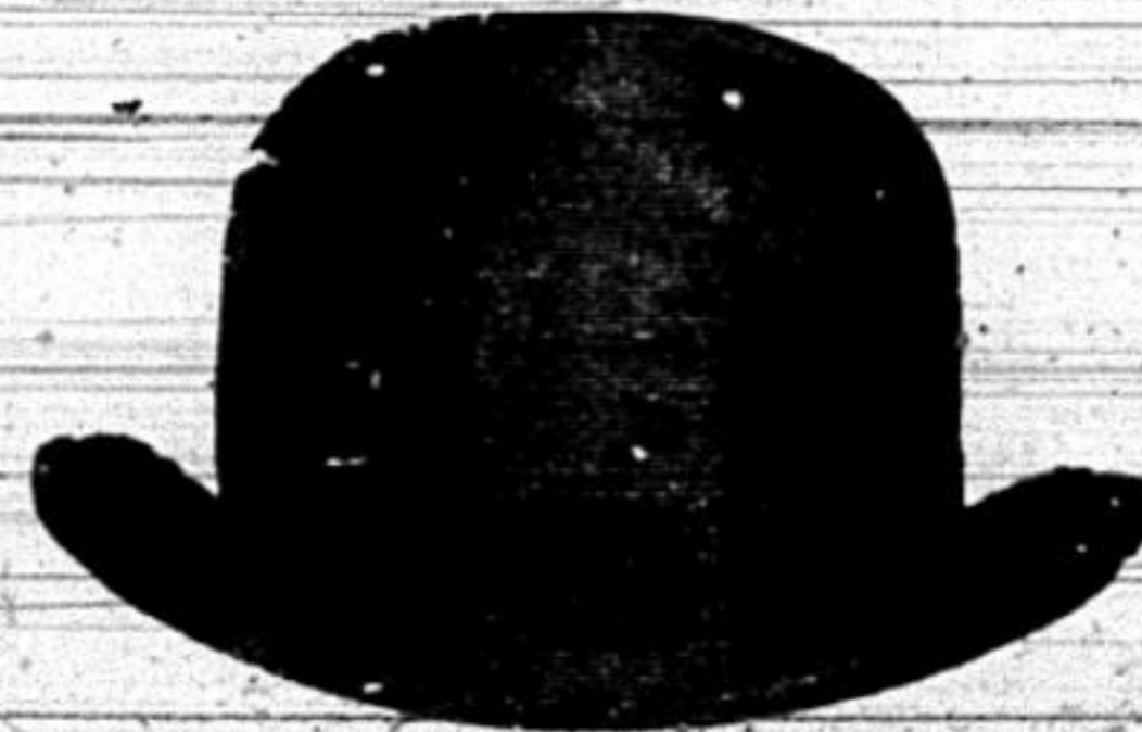
All kinds of sporting or College Caps.

348 Kearny St., Near Pine (entire building)