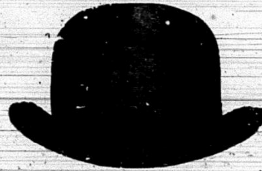
All Kinds of Sporting or College Caps.