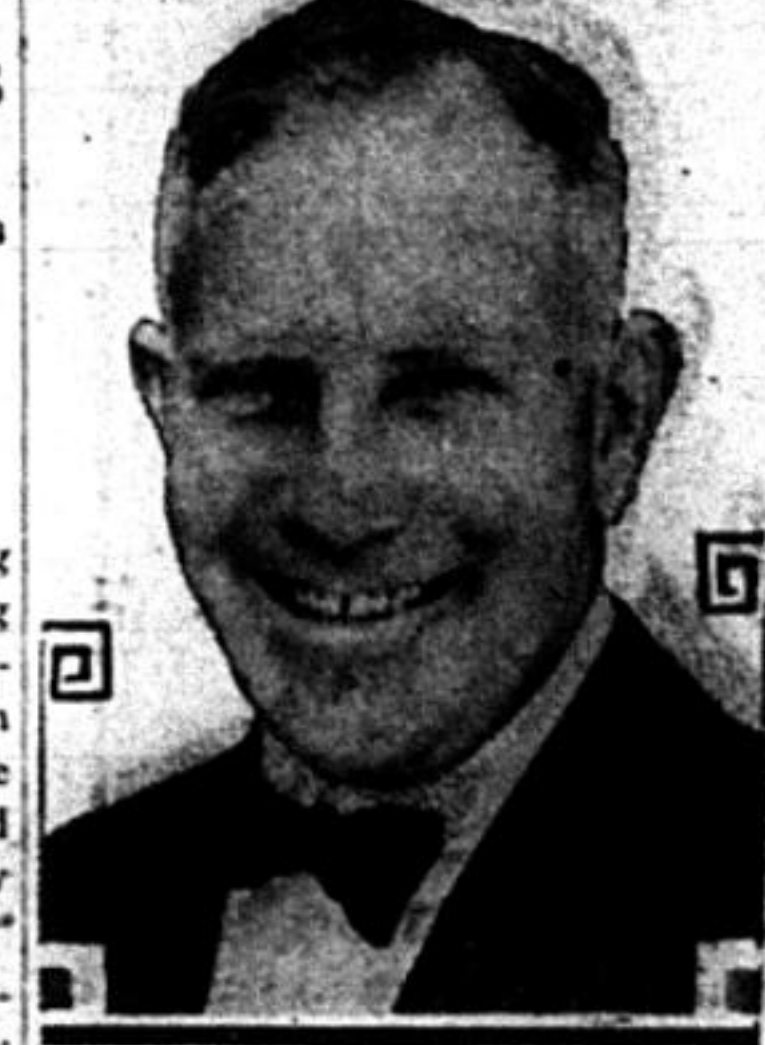
COACH DEAN CROMWELL, U.S.C. track mentor, who claims his championship track team has no more than an even chance against the Bears.