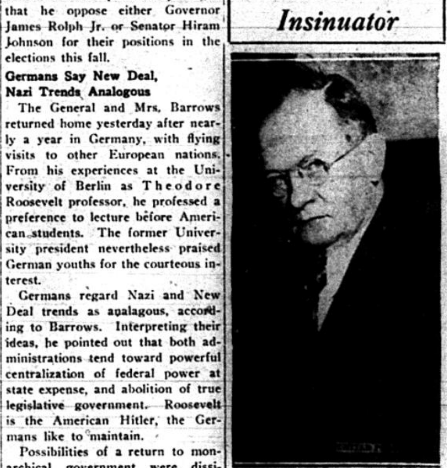
WILLIAM A. WIRT, educator, who yesterday continued charges against "Brain Trusters". Faculty members here condemned him.