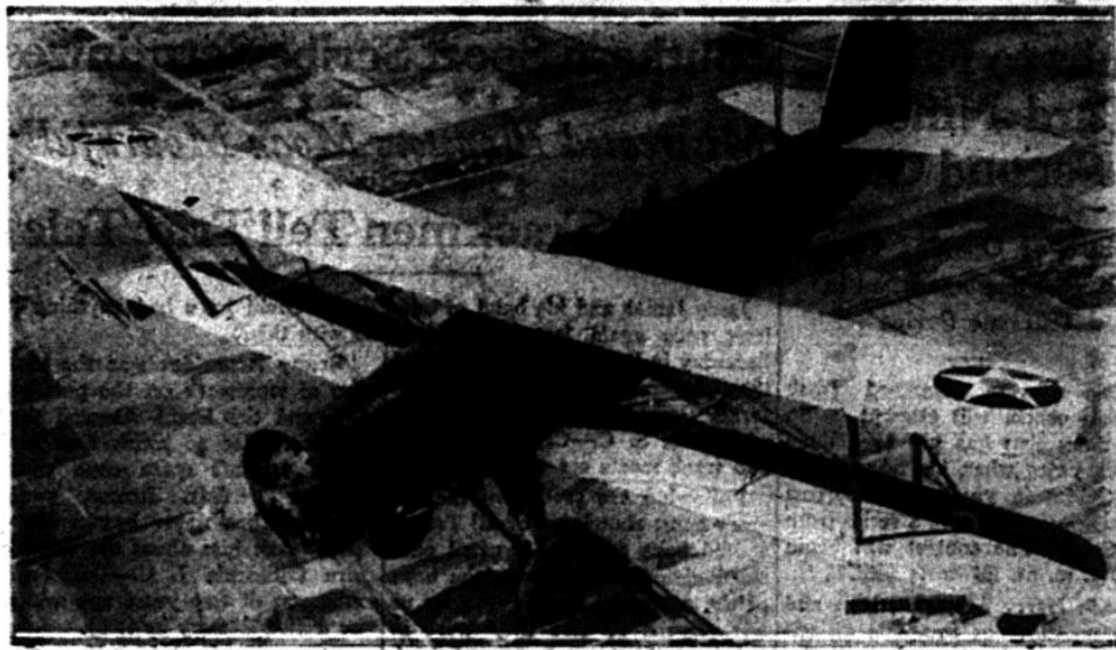
Demonstrating in mid-air, CAPT. WEST-SIDE T. LARSON, chief instructor in blind flying in the western zone, Army Air Corps, shows how to use the new "blind flying hood". The student is required to level himself out of the various positions in which the instructor places him, while the instructor guards against crashes during the tests.