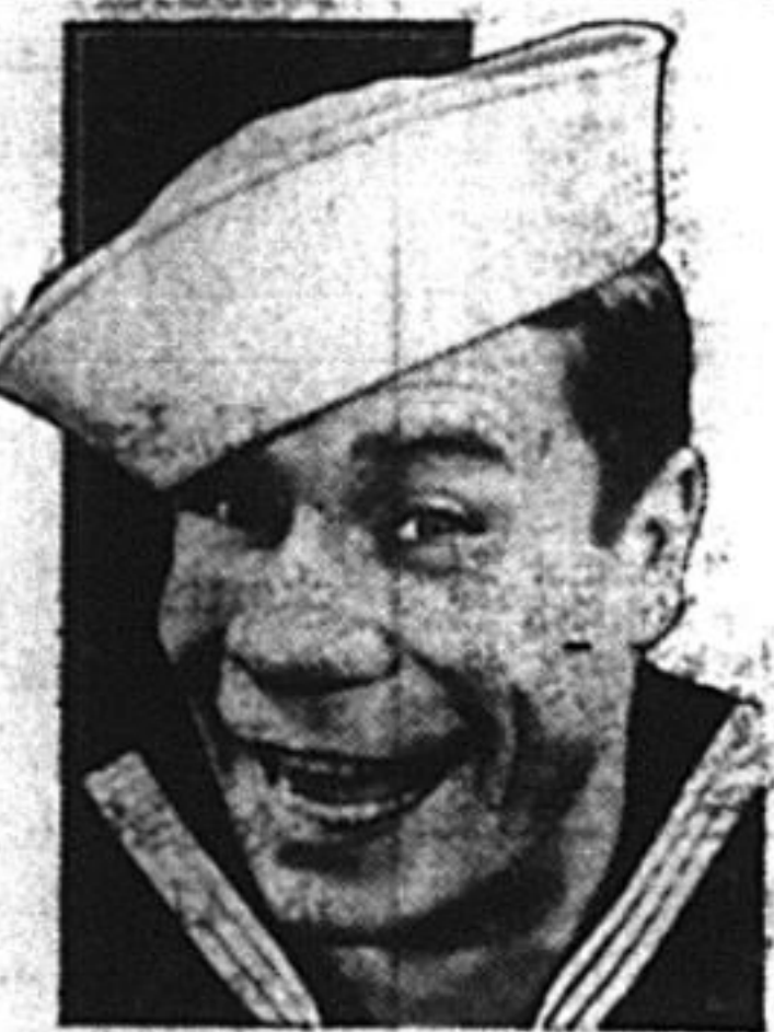
This grinning gentleman is none other than JOE E. BROWN, featured in "Son of a Sailor" at the Fox-Campus theater.