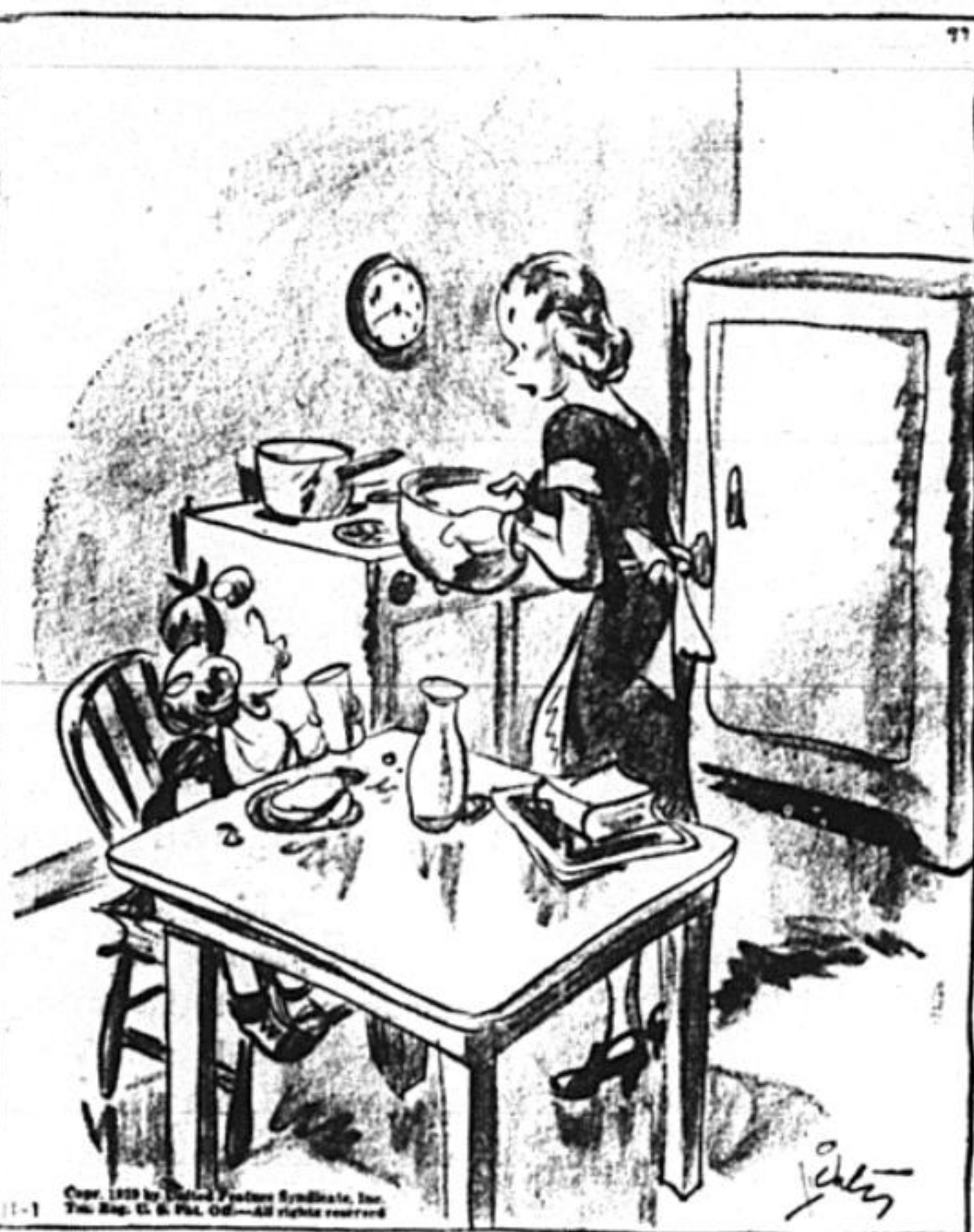
"Didn't learn anything today that would interest you, Mom—all we talked about was our lessons."