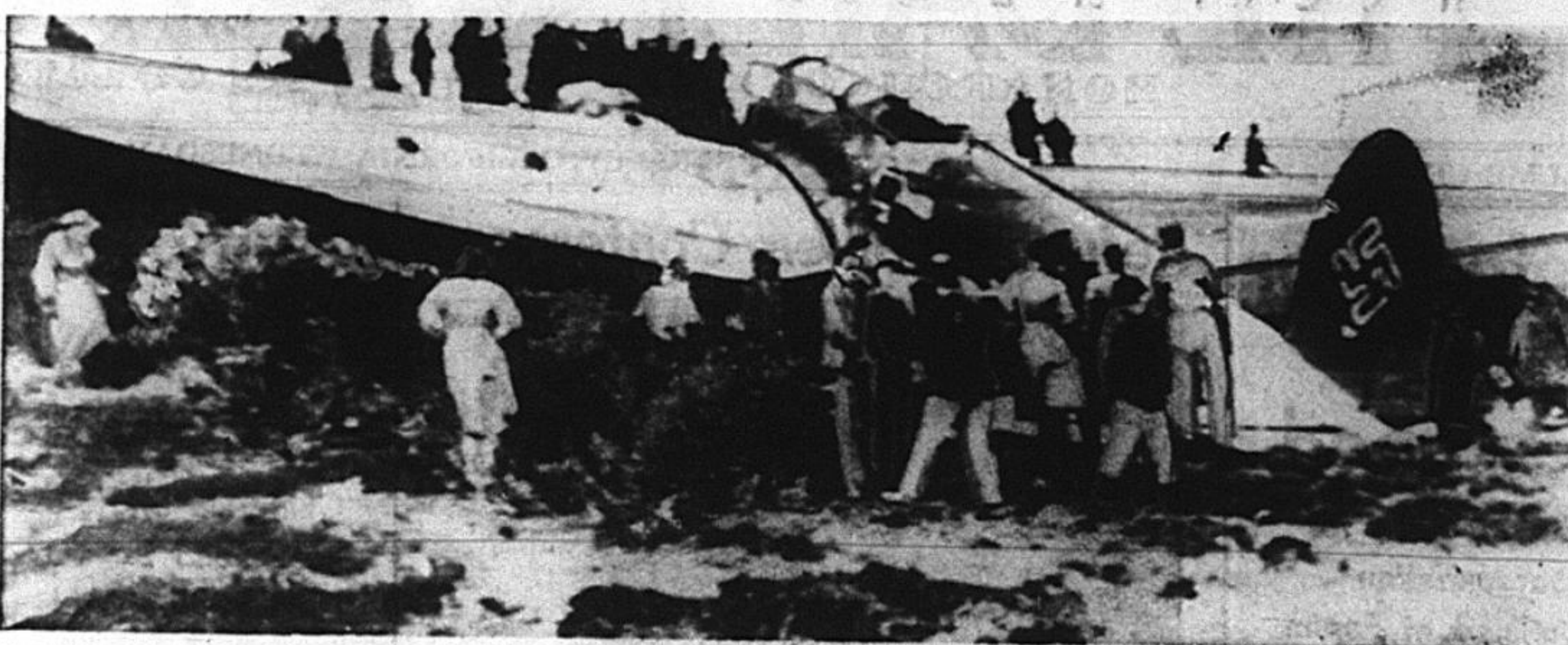
Scottish residents of a small hamlet near Edinburgh, Scotland, crowd around a fast Nazi pursuit plane which was shot down by British anti-aircraft fire. Two gunners in the ship were killed, and a third wounded, but the pilot escaped unharmed. This photo was radioed from London to New York City after it had passed through the British war-time censorship.