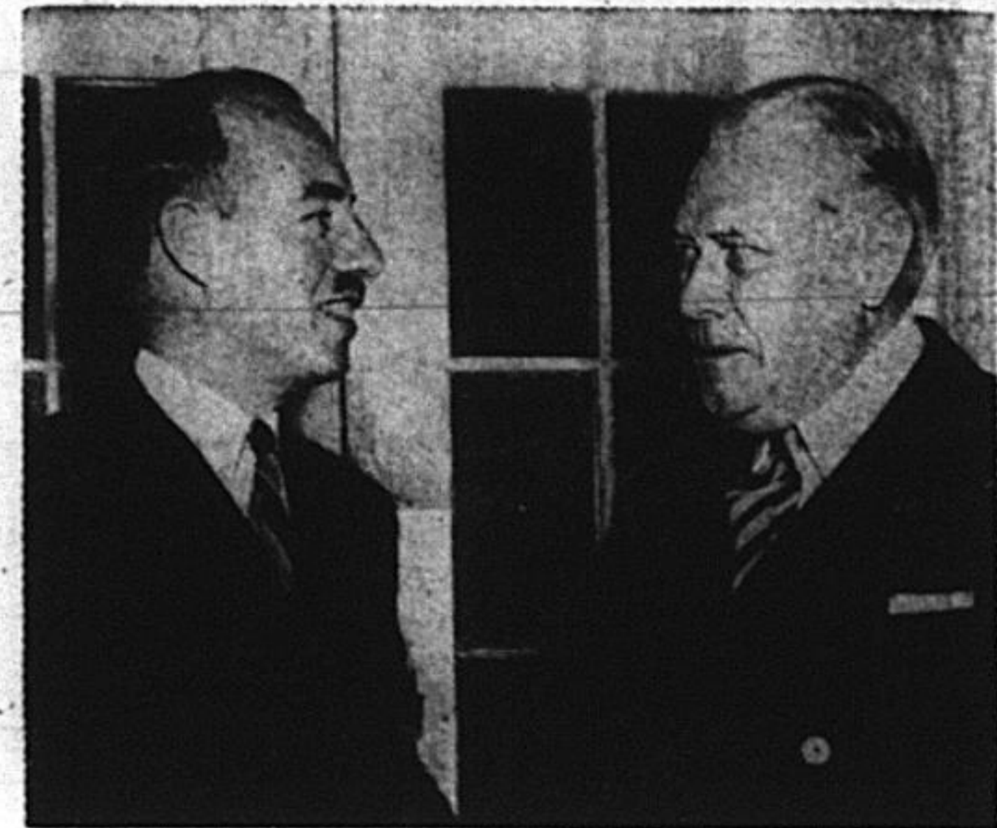
Arriving at the White House this week for a conference with the President on the refugee problem are former PREMIER PAUL VAN ZEELAND of Belgium and MYRON TAYLOR, vice-chairman of the Inter-government Political Refugee committee.