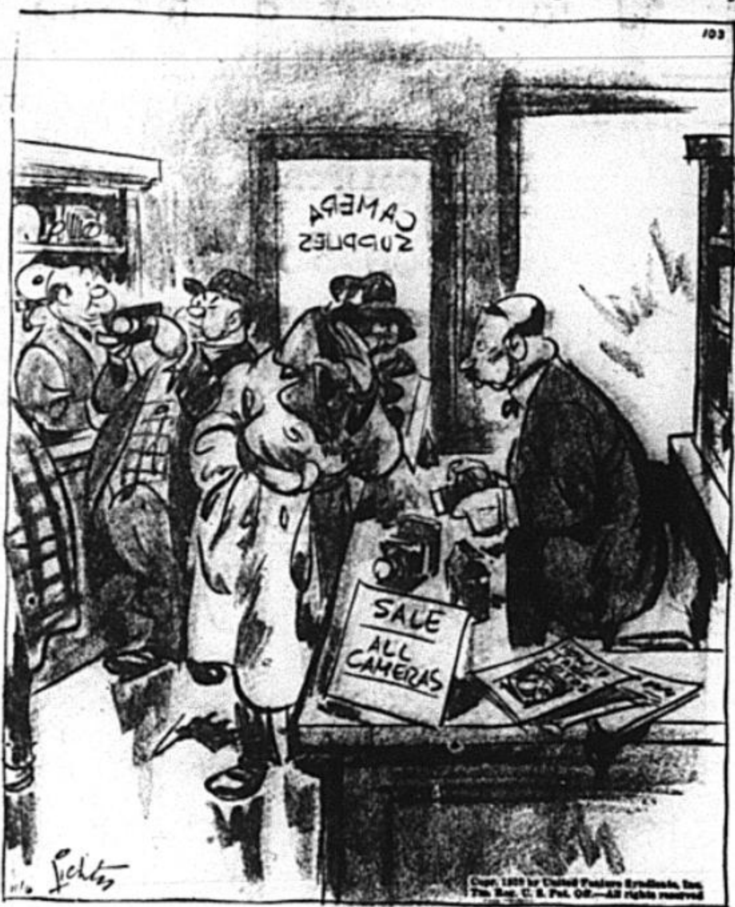
"Pss!—any special discount to the spy trade?"