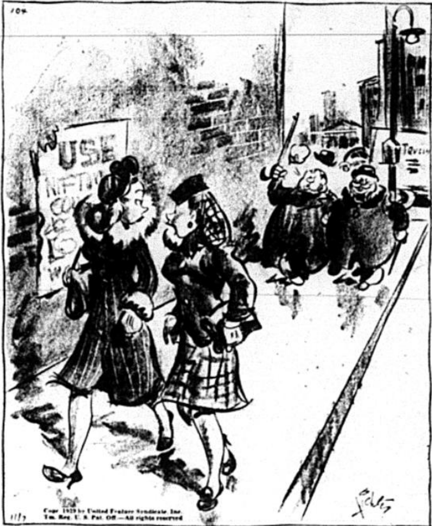
"Slow down, Gert—ain't you got no respect for age?"