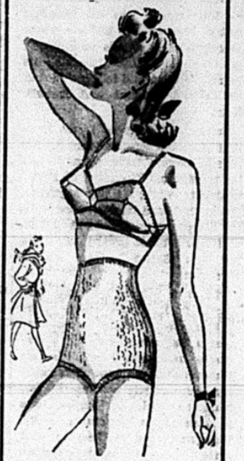
Figure Freedom For the active coed—bent on strolling, skating, foating, dating—in a wide selection of girdles—from 1.95—Extra lengths at 3.50.