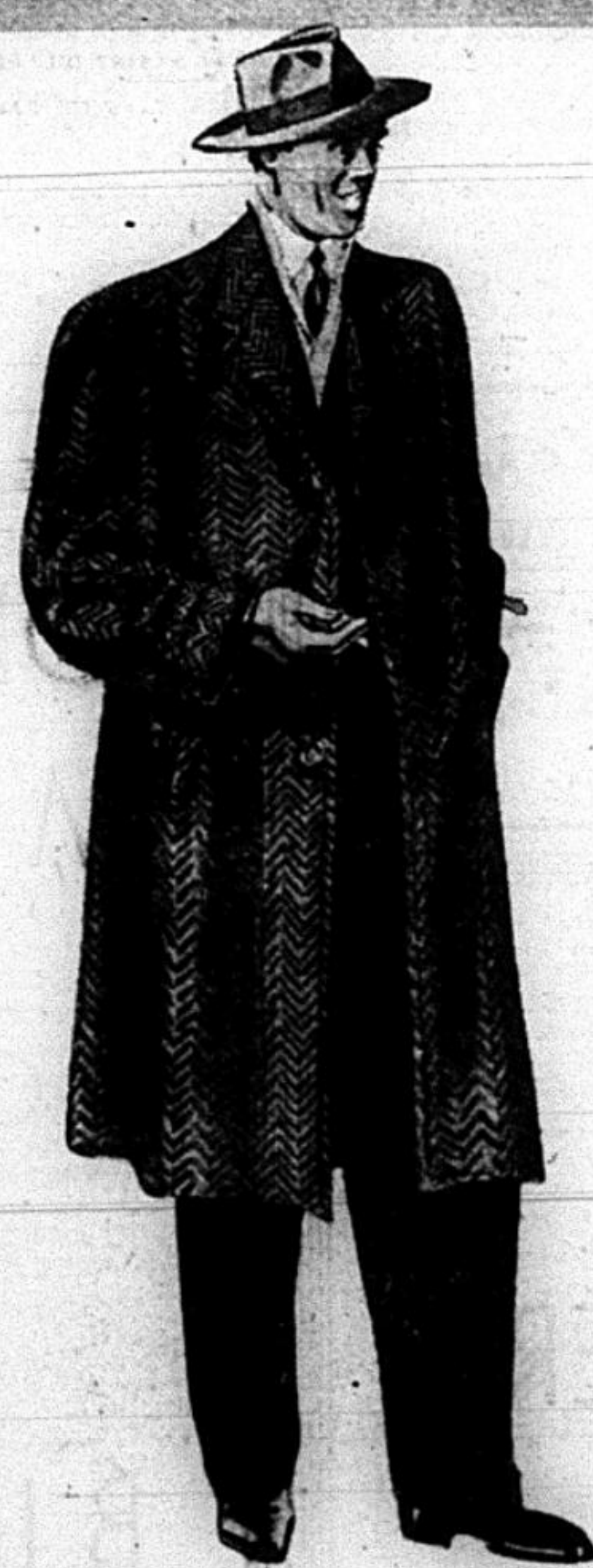
KNIT-TEX: Smart tweeds made of imported British wools. Warm but comfortably light in weight. Shower resistant '30