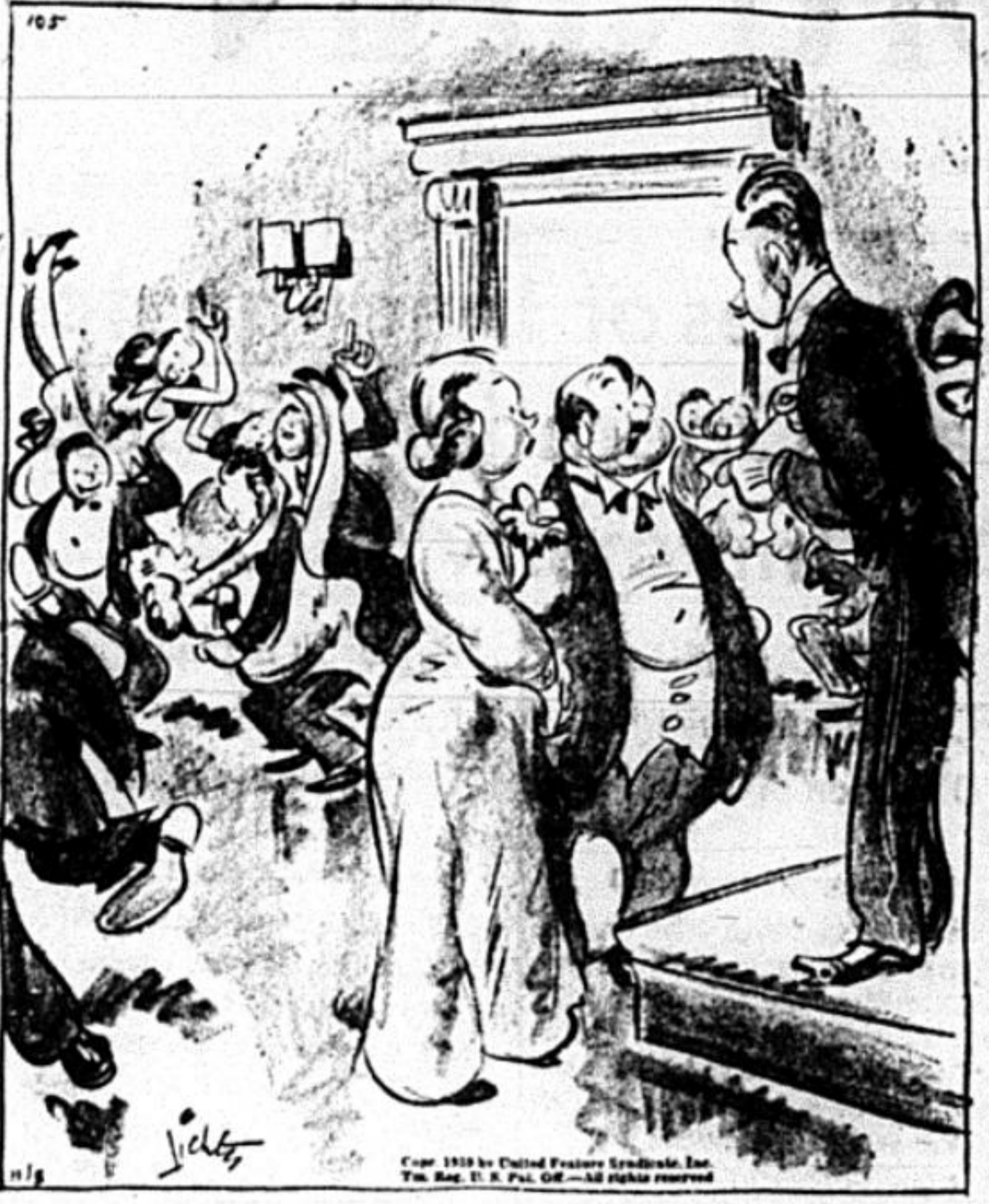
"Can you play some old fashioned dances—like the Black Bottom?"