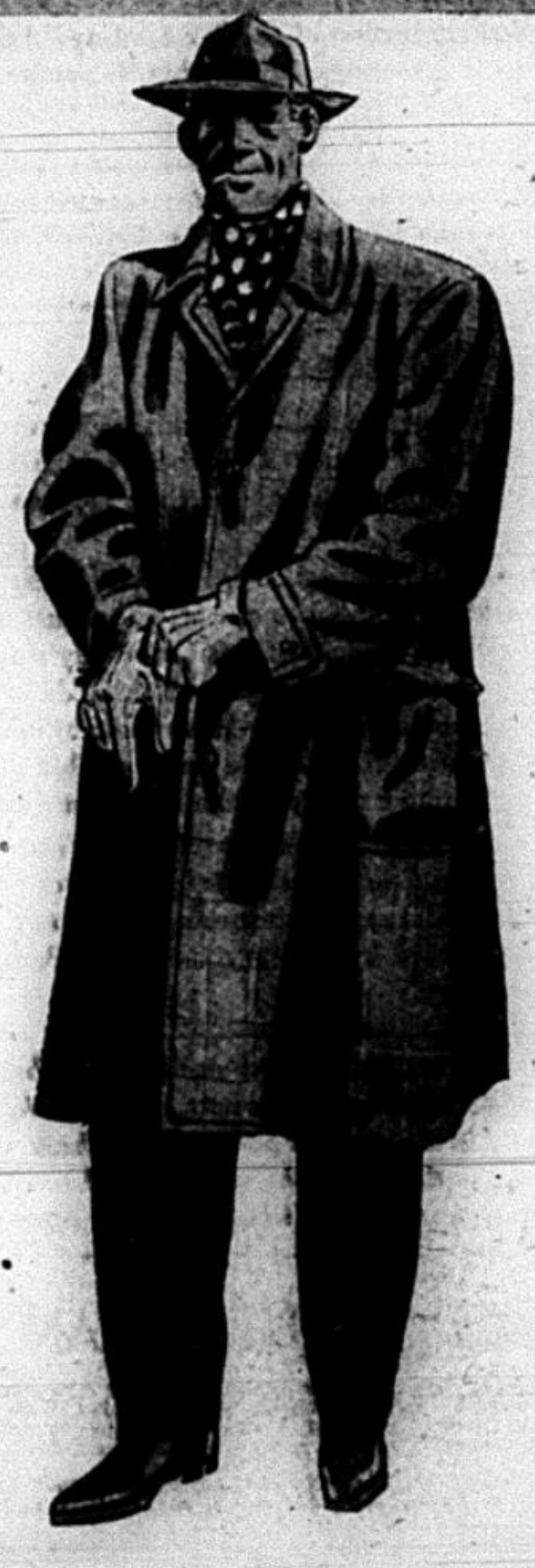
"TOPOVER": Everything a topcoat should be! Everything an overcoat should be! Balmacaan, Box or Raglan model. Imported Kashmir Shetland Fabrics '40