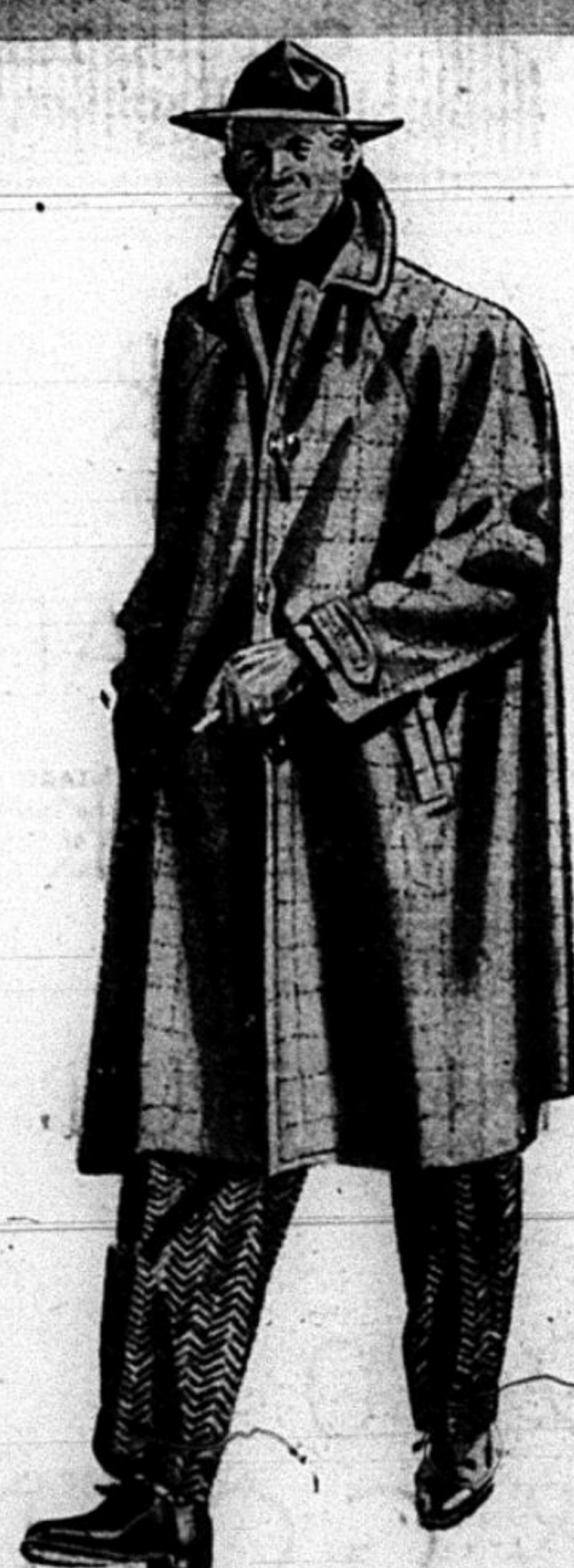
BALMACAAN: Public Topcoat No. 1. Full cut with swagger ease and comfort. Smart covers and smooth finished fabrics '30