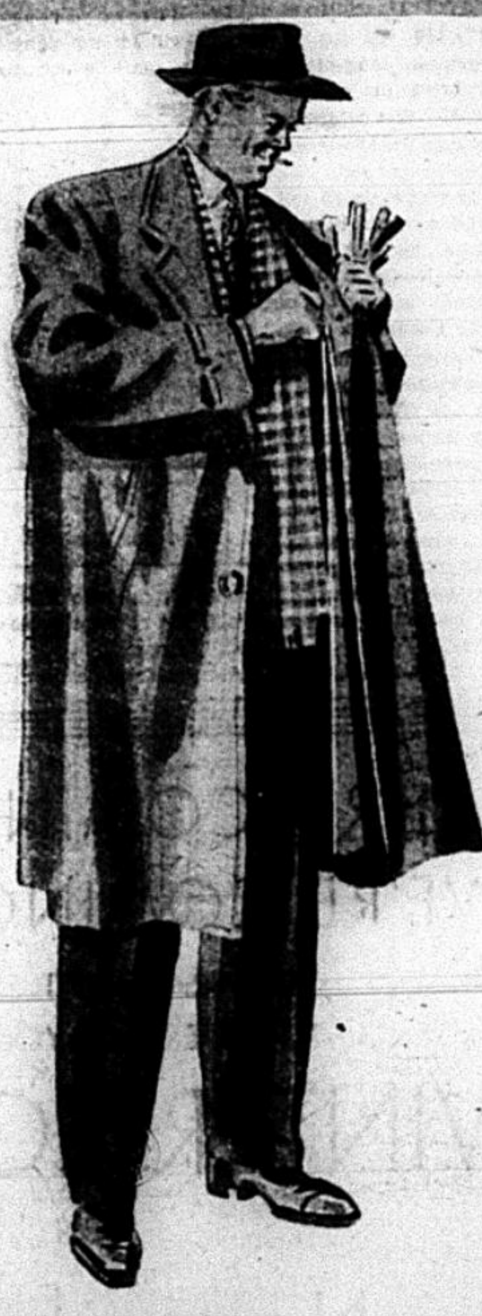
"SEASON SKIPPER": Two topcoats in one! It has an inner wool lining to be zip-ed in for cold weather . . . out for warm. '35