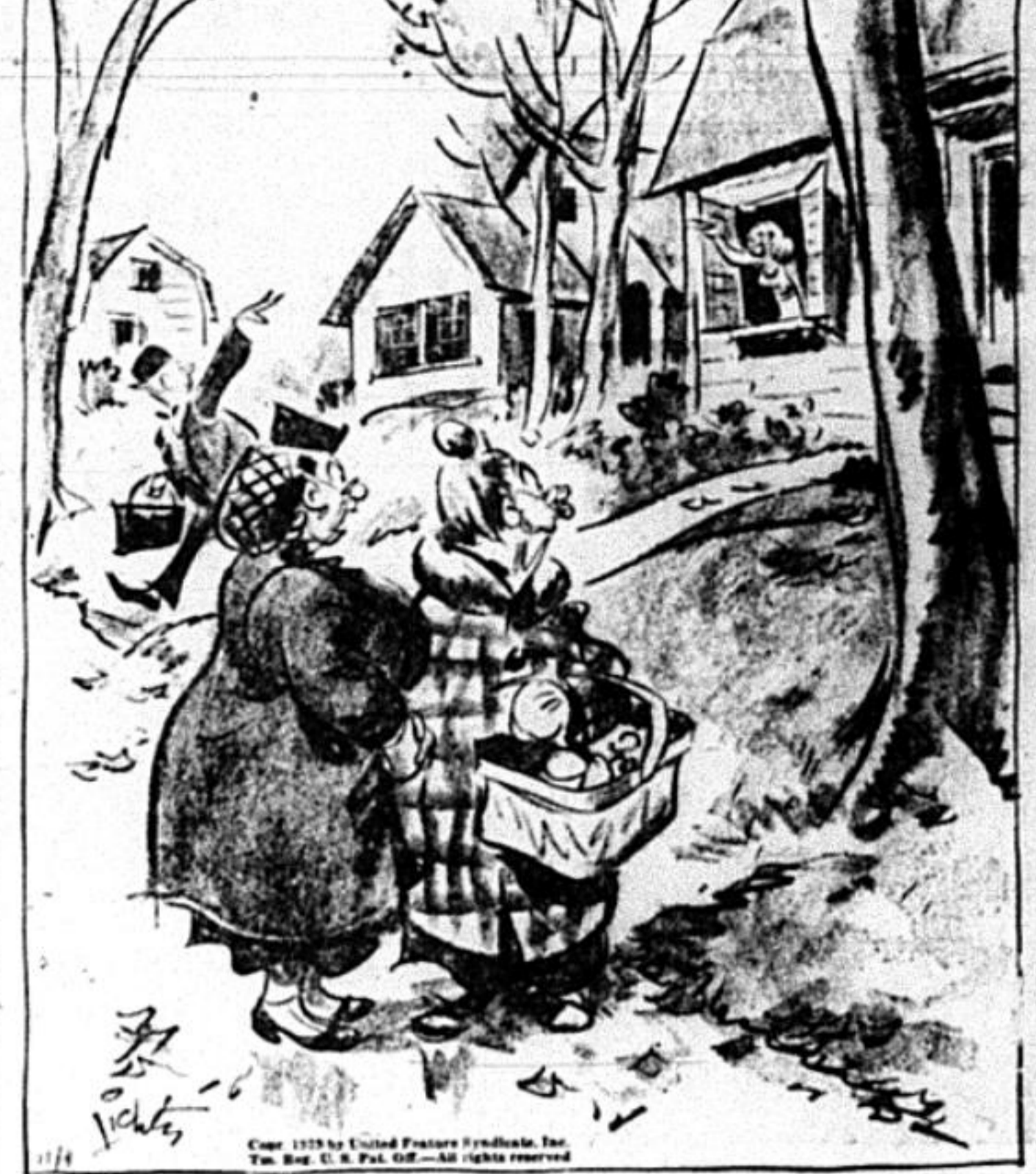
"Of course she's unhappily married—but the little fool doesn't realize it!"