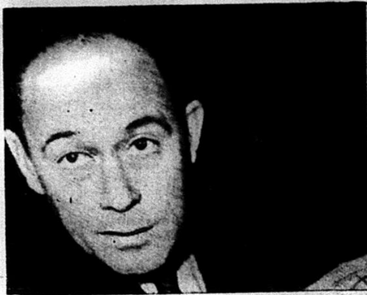
Two votes that went into the "Yes" column in the vote on "Ham and Eggs—$30 Every Thursday" in California's special election Tuesday were those