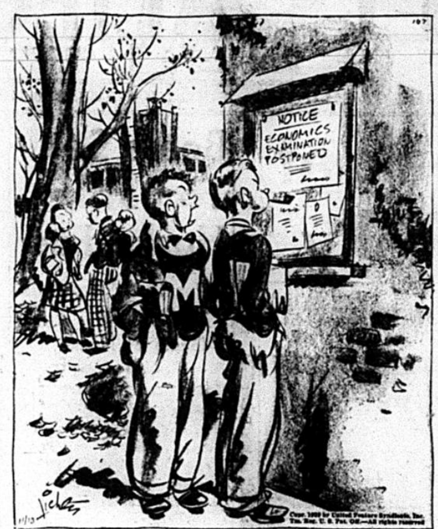
"Shucks—now we'll have to remember that stuff for another day!"