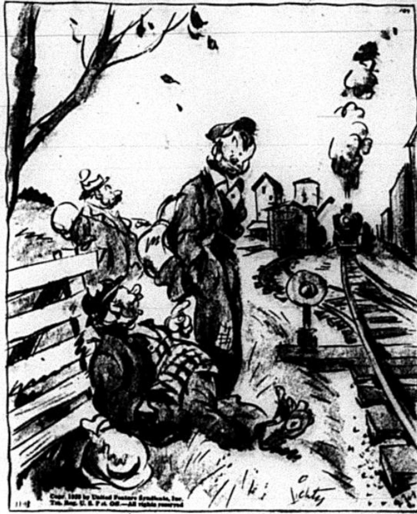
"You'd stand more chance of gettin' a job if you shaved and looked presentable, Bud—I found that out years ago!"