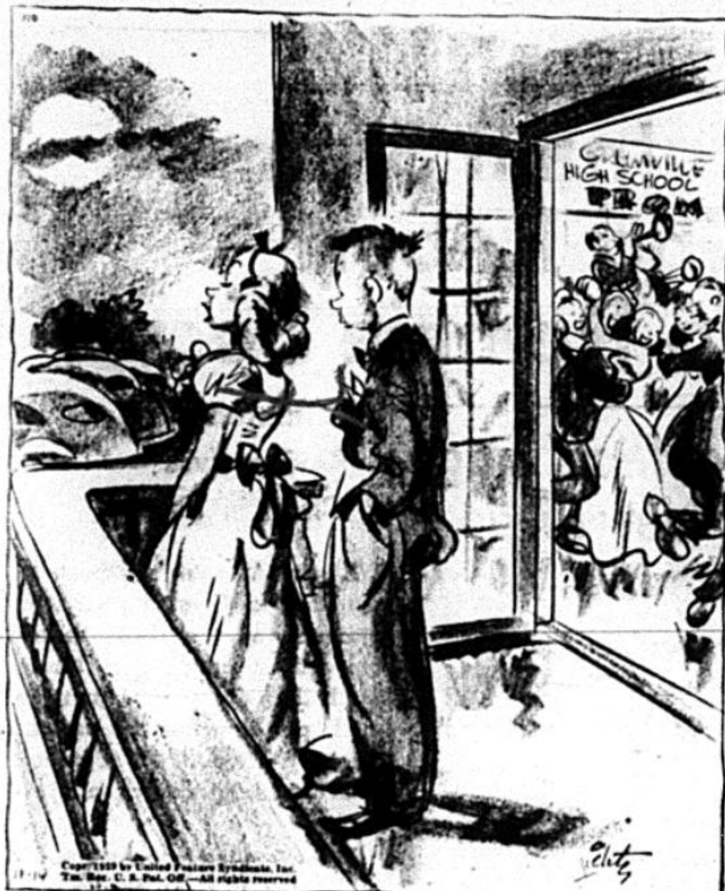
"You've broken my heart, wrecked my whole life, and ruined my entire evening."