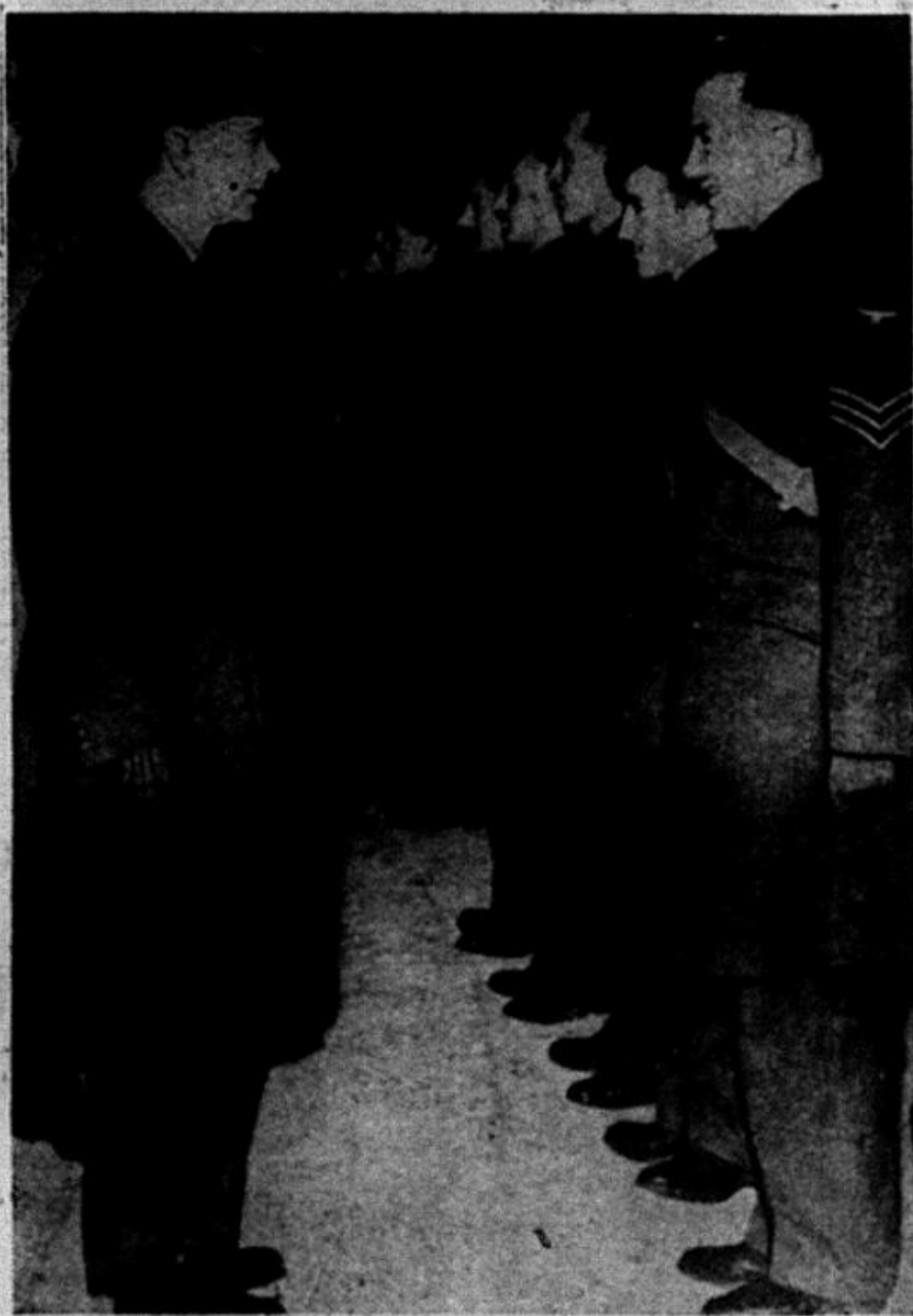
KING GEORGE of England is shown above as he congratulates members of a reconnaissance flight over Germany. Bad weather and other hazards of the flight won the personal acclaim of their monarch for the aviators.