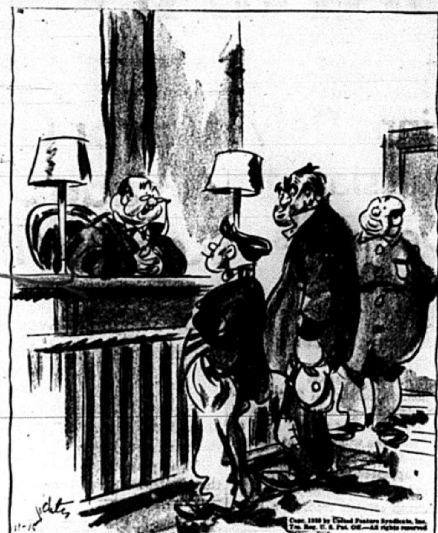
"Do you plead not guilty to assault and battery, or do you care to boast?"