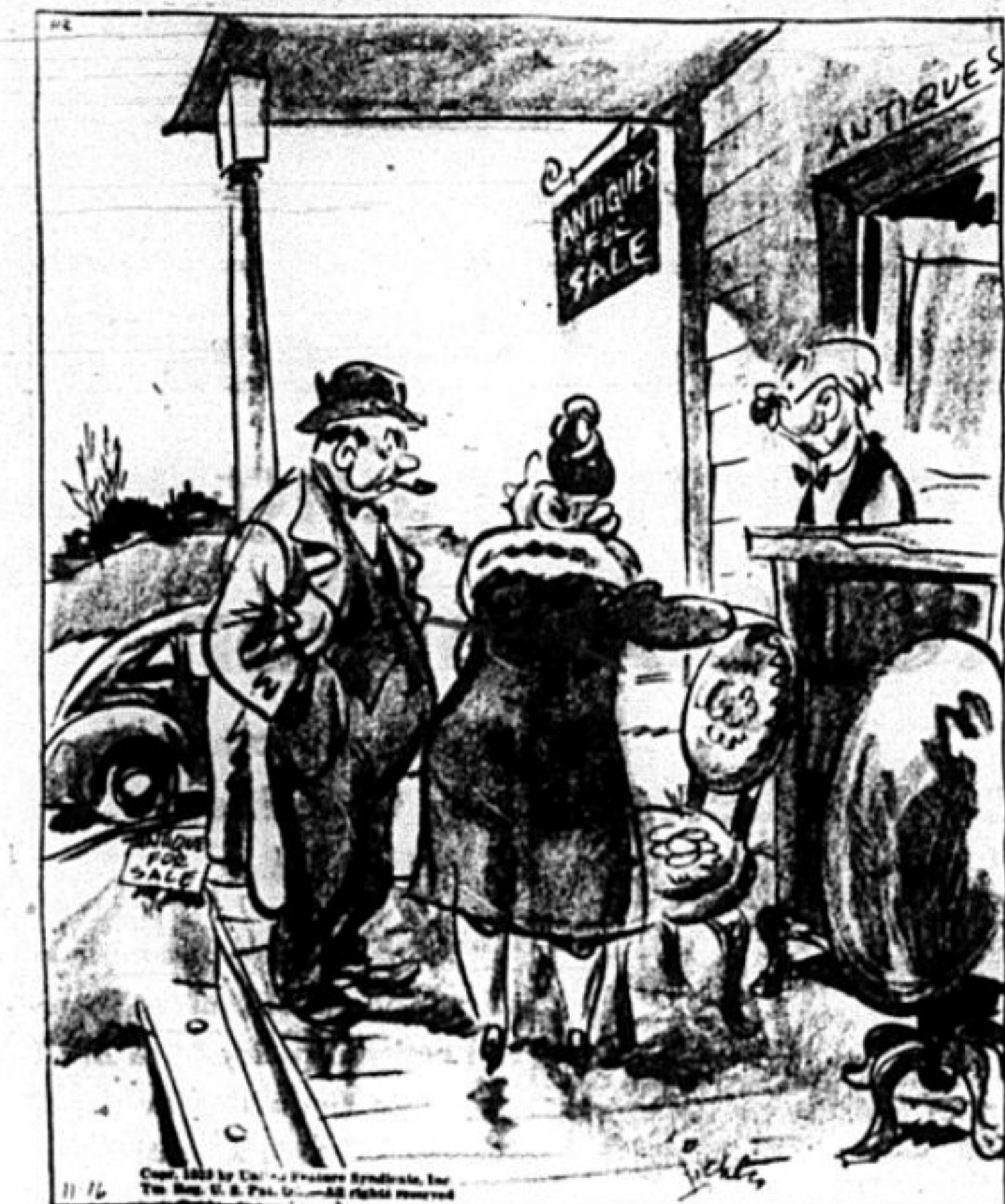
"It's a bargain when you stop to figure how wages and materials have gone up since the war!"

Women's Masonic club will sponsor a pot-luck supper at 6 p.m. today at the clubhouse. Women attending are asked to bring some food, and the men 15 cents to cover other expenses. At 7:30 p.m. today, the Men's Masonic club will hold a skating party at Rollerland in Oakland. Price will be 40 cents a person.