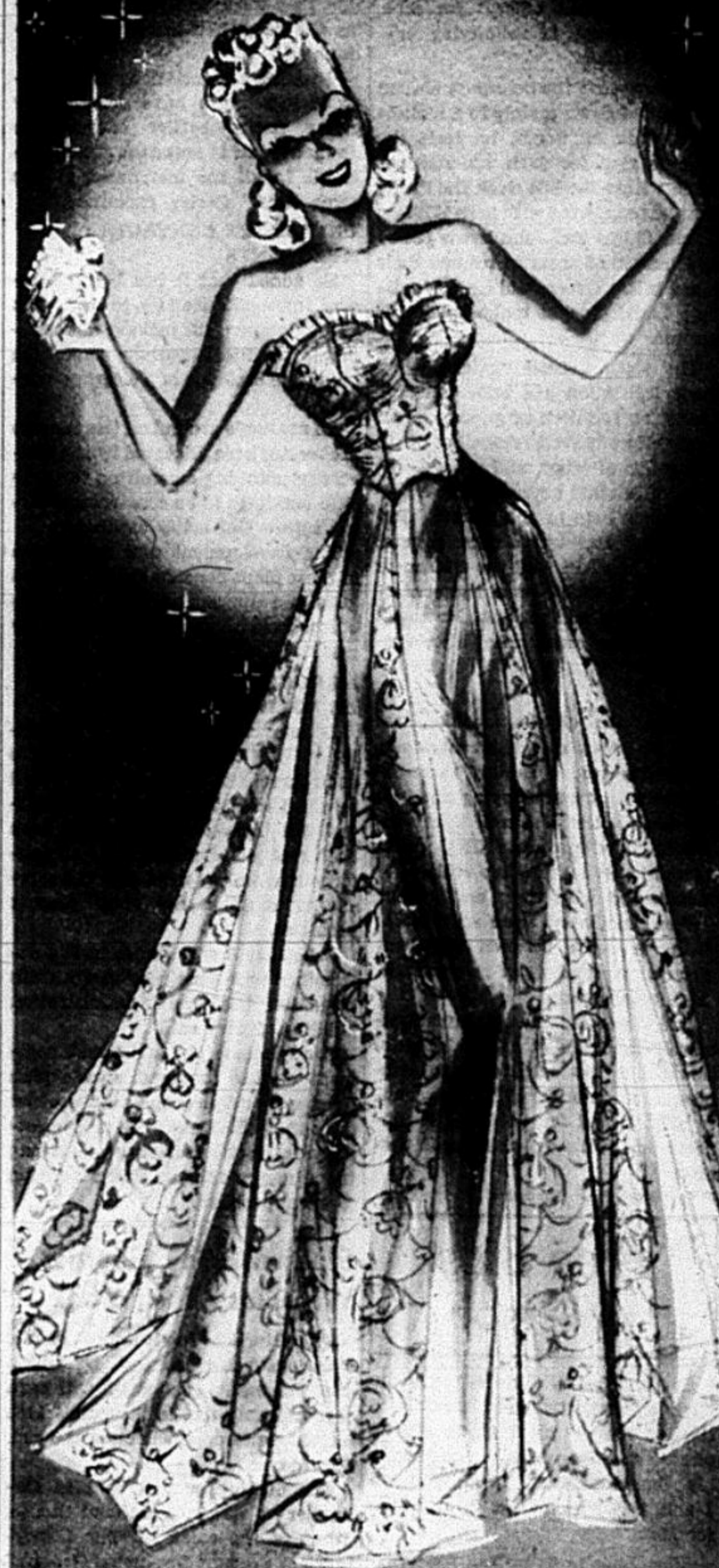
Metal-Shot Net... Bouffant