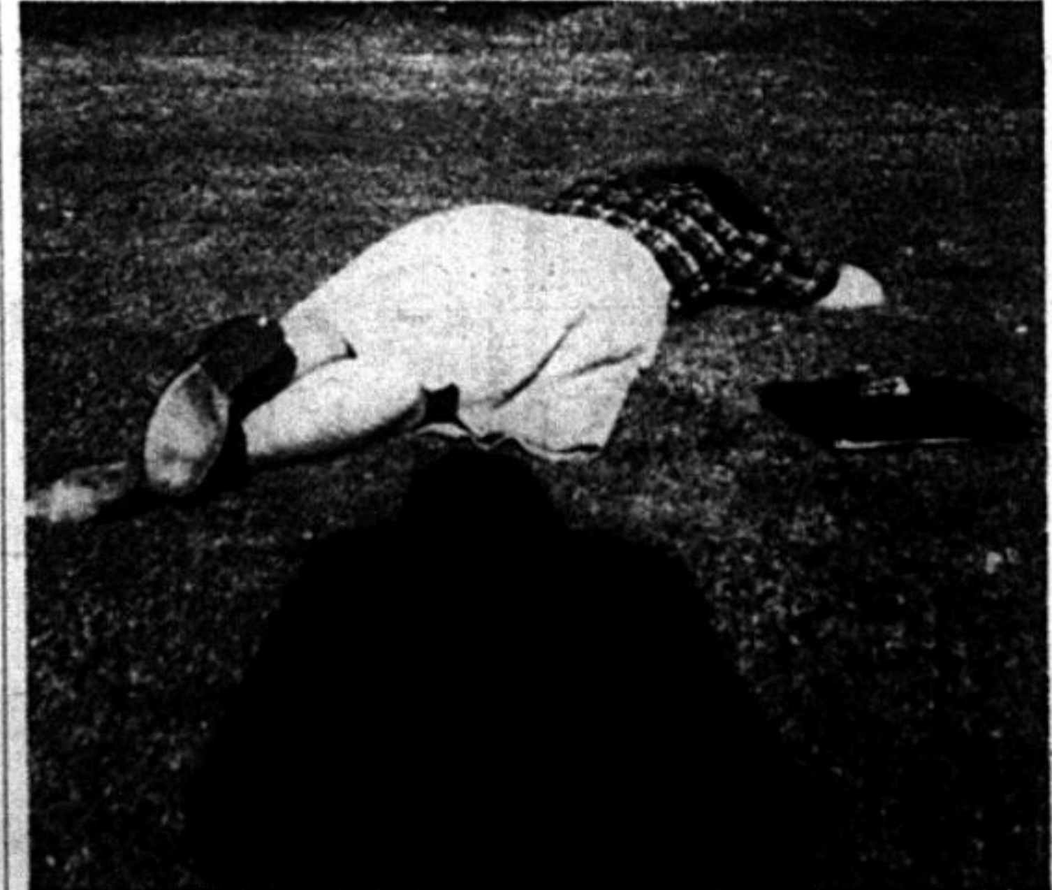
This time she's heartbroken because she didn't get her Blue and Gold assessment on time. Having reached the quota of 2000 senior sales, the managerial staff will enforce the deadline strictly this year.