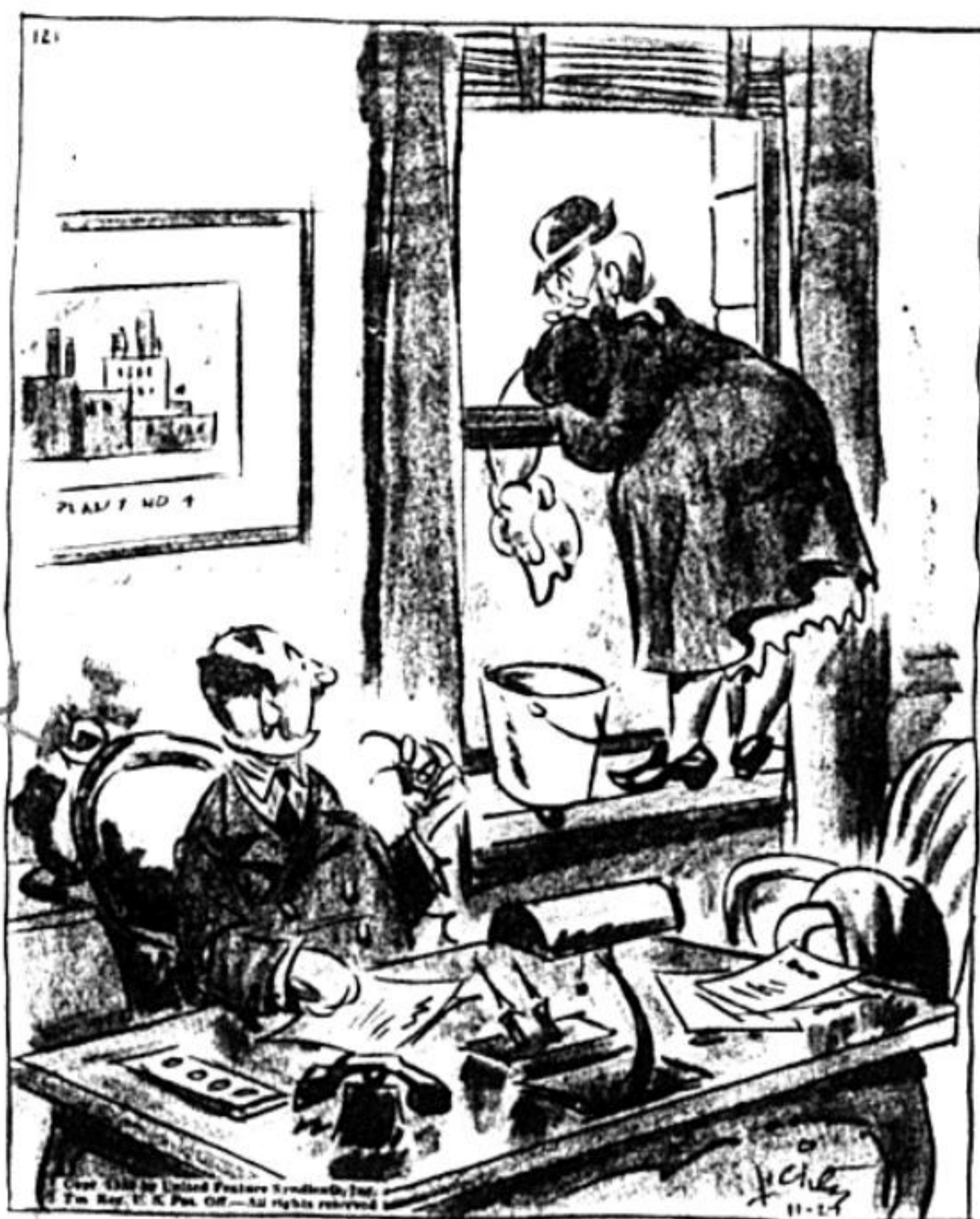
"Stop fussing when you visit me, Mama--there's a man who does that work!"

YWCA FRESHMAN COMMISSION will meet at 12 m. today in the "Y" cottage.