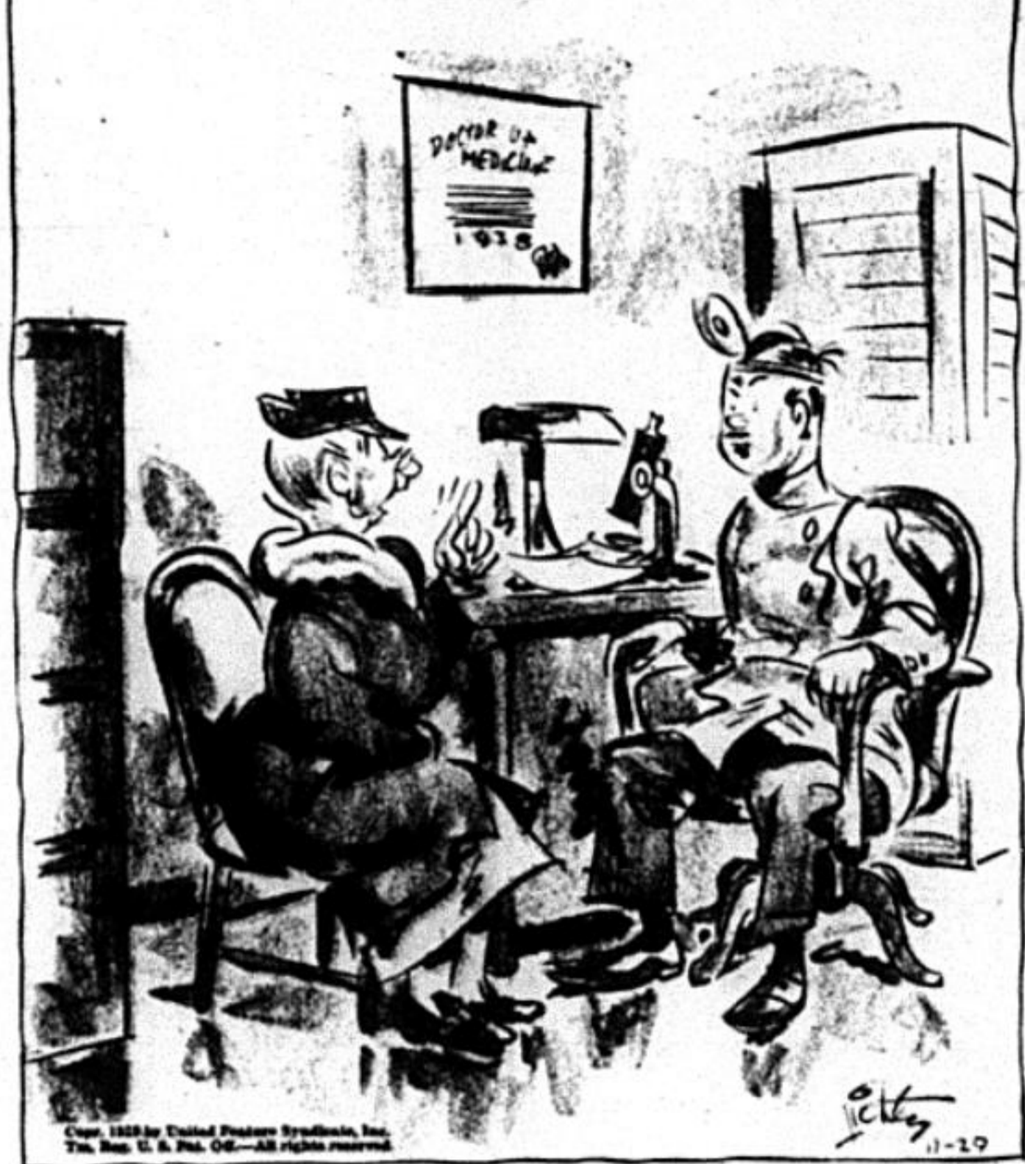
"Don't contradict me, young man—I've been ailing for 20 years and ought to know what's wrong with me!"