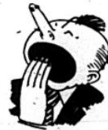
We need a little more gaiety.

The Grizzly is high class. You can't hawk a guy into purchasing a peachy woodcut or buying a smooth story