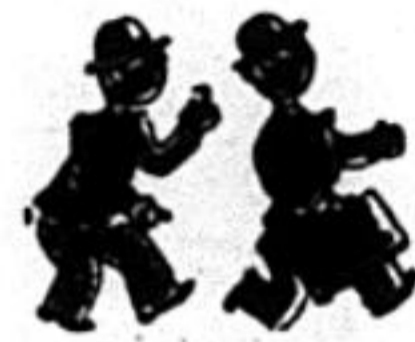
You gotta whisper in his ear.

Not enough to wake the campus out of the gloom. Selling Grizzlies ain't like peddling tickets to the Mask and Dagger show, for instance, or selling Pellcans.