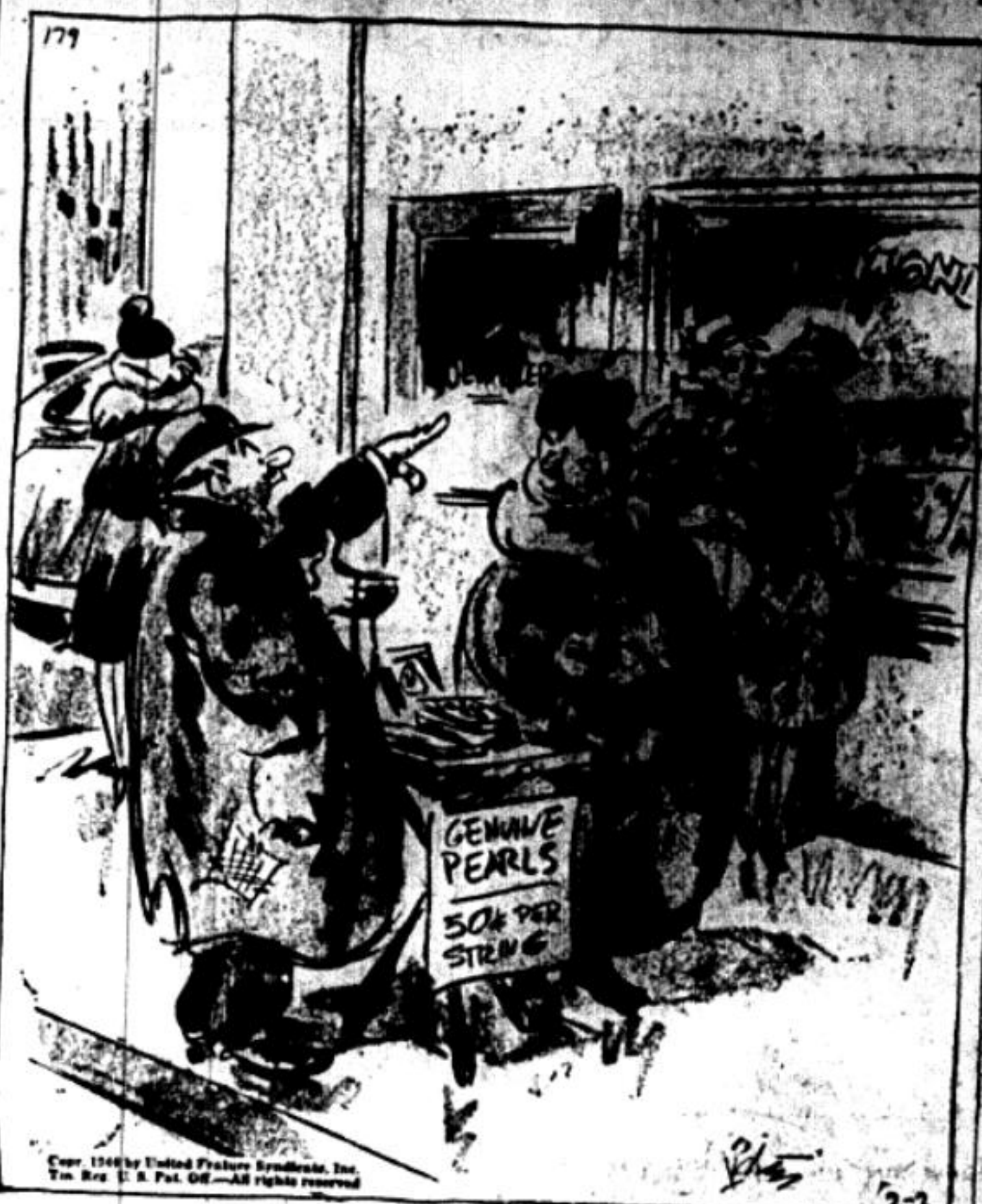
"That's my final price, lady—go in there, why don't'che, an' see what THEY get for pearls!"