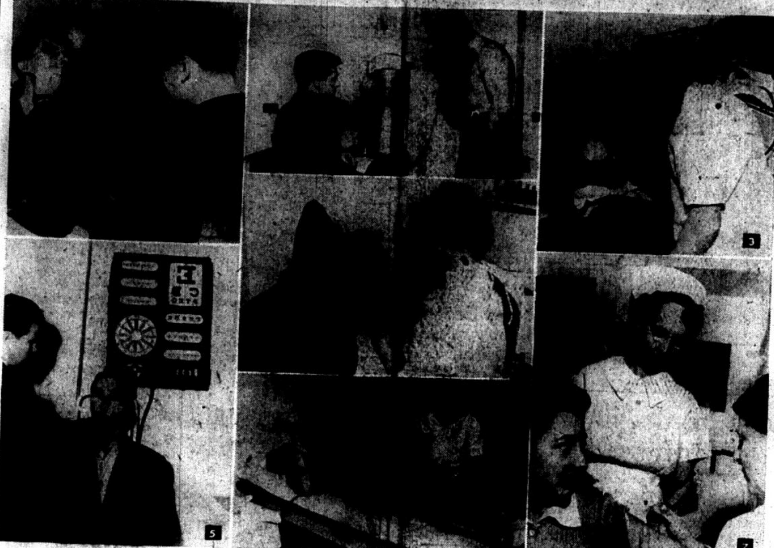
Before any student enters the University he must take a series of medical examinations at Cowell hospital and physical examinations at the Gymnasium for Men or Hearst gymnasium. Some of the examinations are: (1) ear and nose, (2) lung, (3) dental, (4) Wassermann blood test which is not compulsory, (5) eye, (6) tuberculosis, and (7) vaccination.