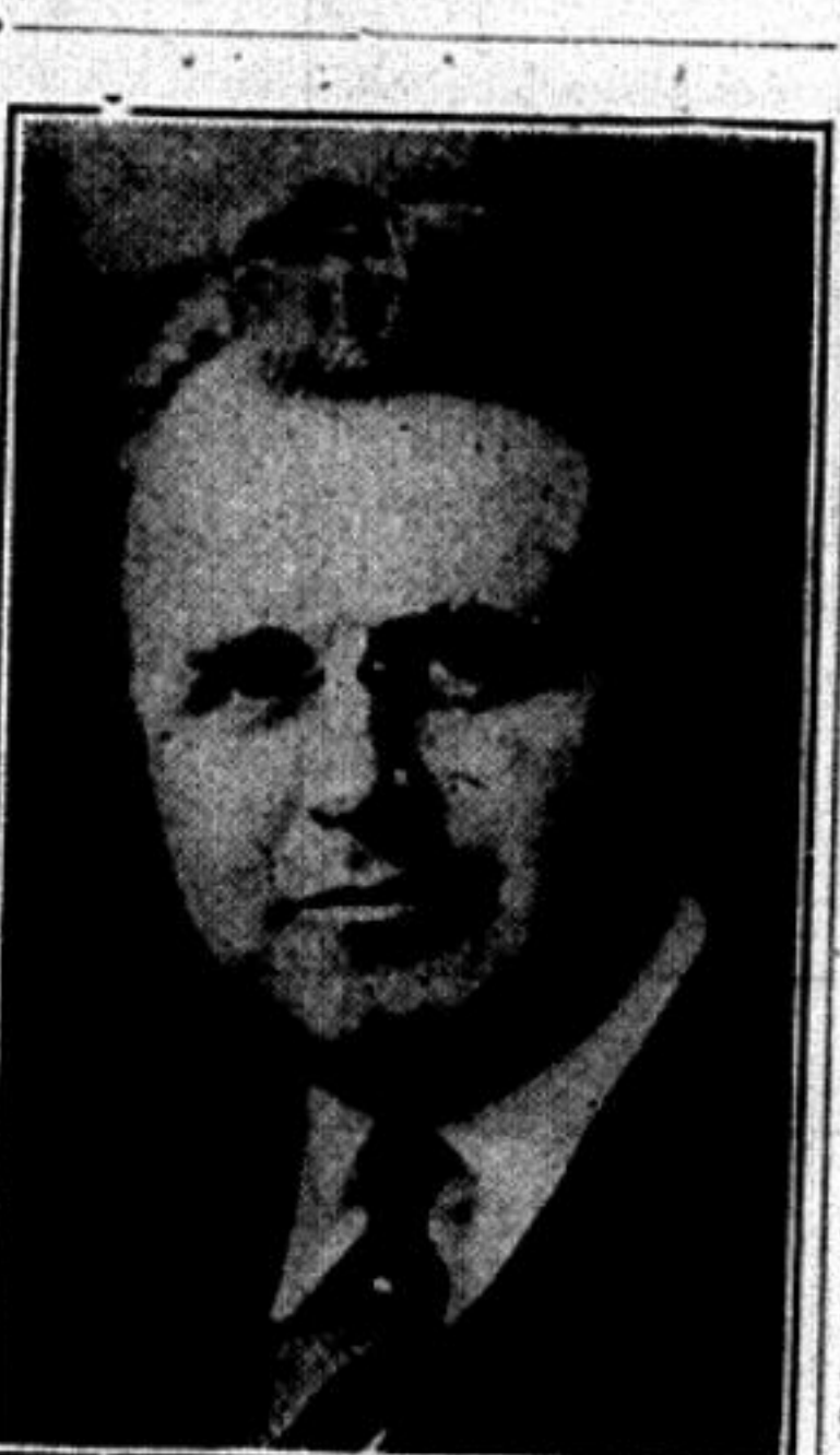
HENRY F. GRADY Assistant Secretary of State

"The day of reckoning in foreign trade did not come. In 1929, our loans abroad were curtailed. The situation was greatly aggravated in 1930 by the passage of the Hawley-Smoot Tariff Act. This Act not only raised our own tariffs to such heights that it seriously curtailed our imports from other countries, thereby decreasing their ability to purchase goods, but it led other countries to raise their tariffs and to impose oth-