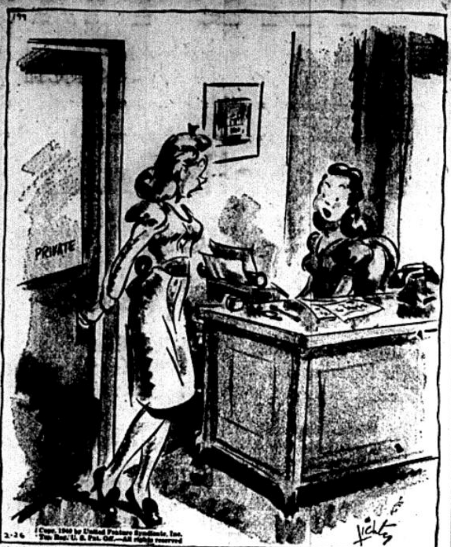
"I told him 90 per cent of my money goes for clothes and I just couldn't live on starvation wages any longer!"