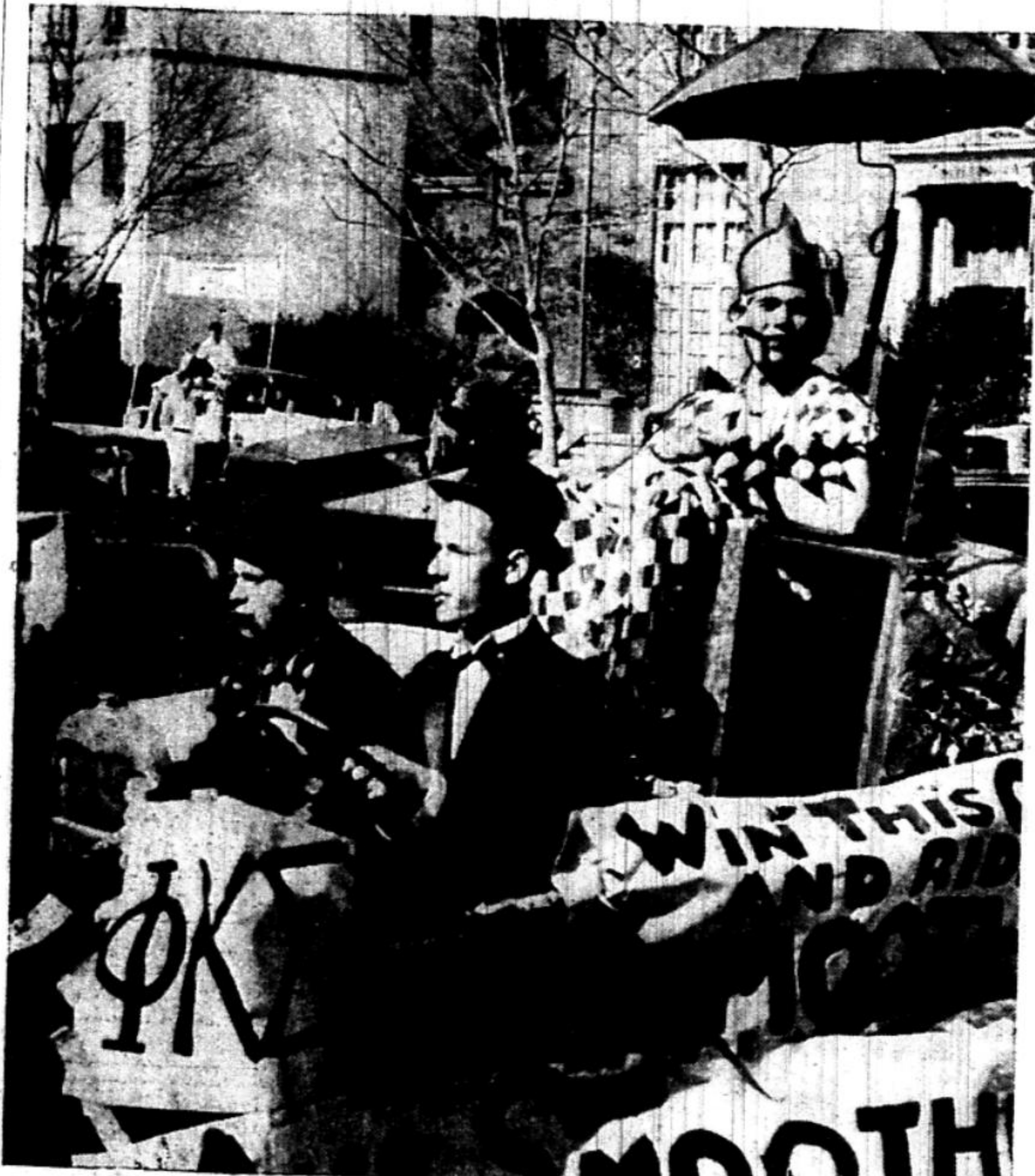
Tucked away in The Californian files was a cut of the prize winning float in the Big "C" Sirkus parade in 1936. The Phi Kappa Sigma float, shown above, walked away with the honors four years ago.