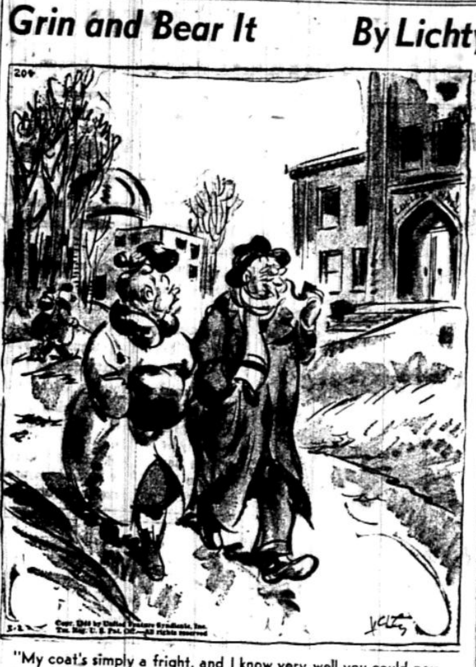
"My coat's simply a fright, and I know very well you could pay for one by simply dashing off a new text-book!"