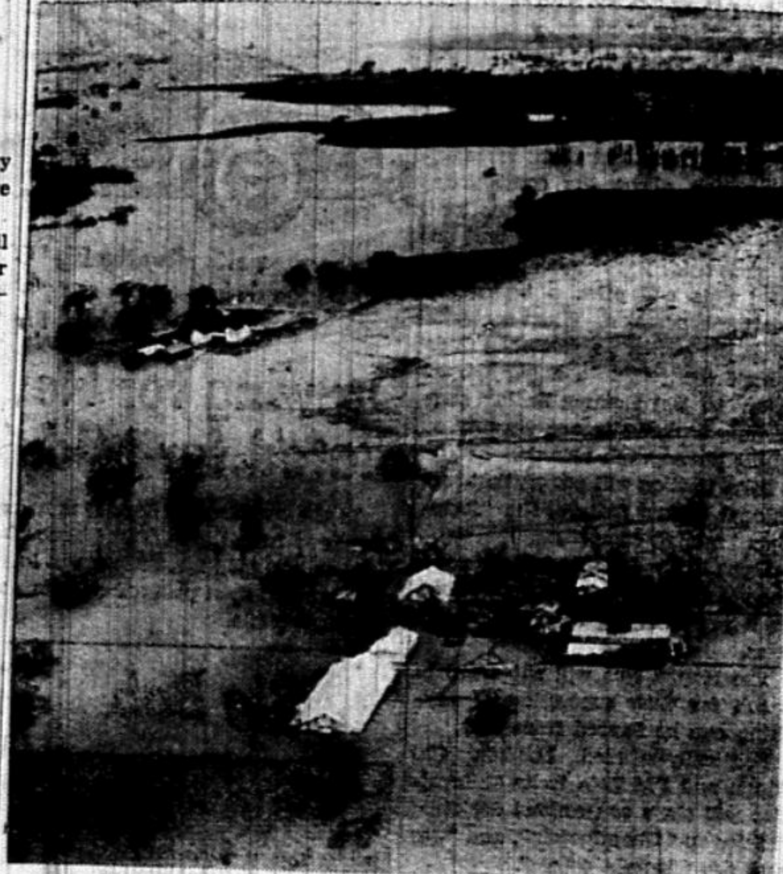
Worried because of lack of rain as spring planting drew near, Northern California farmers are faced with the above-pictured fate as the result of too much rain. This air picture of a flooded farm depicts future consequences.