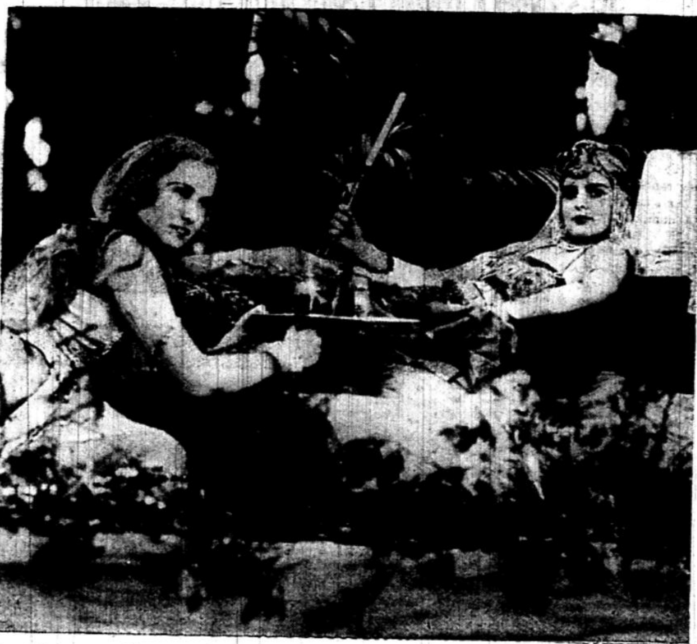
Two college generations ago, the Alpha Xi Delta float contest. Their prize winning entry is shown above.