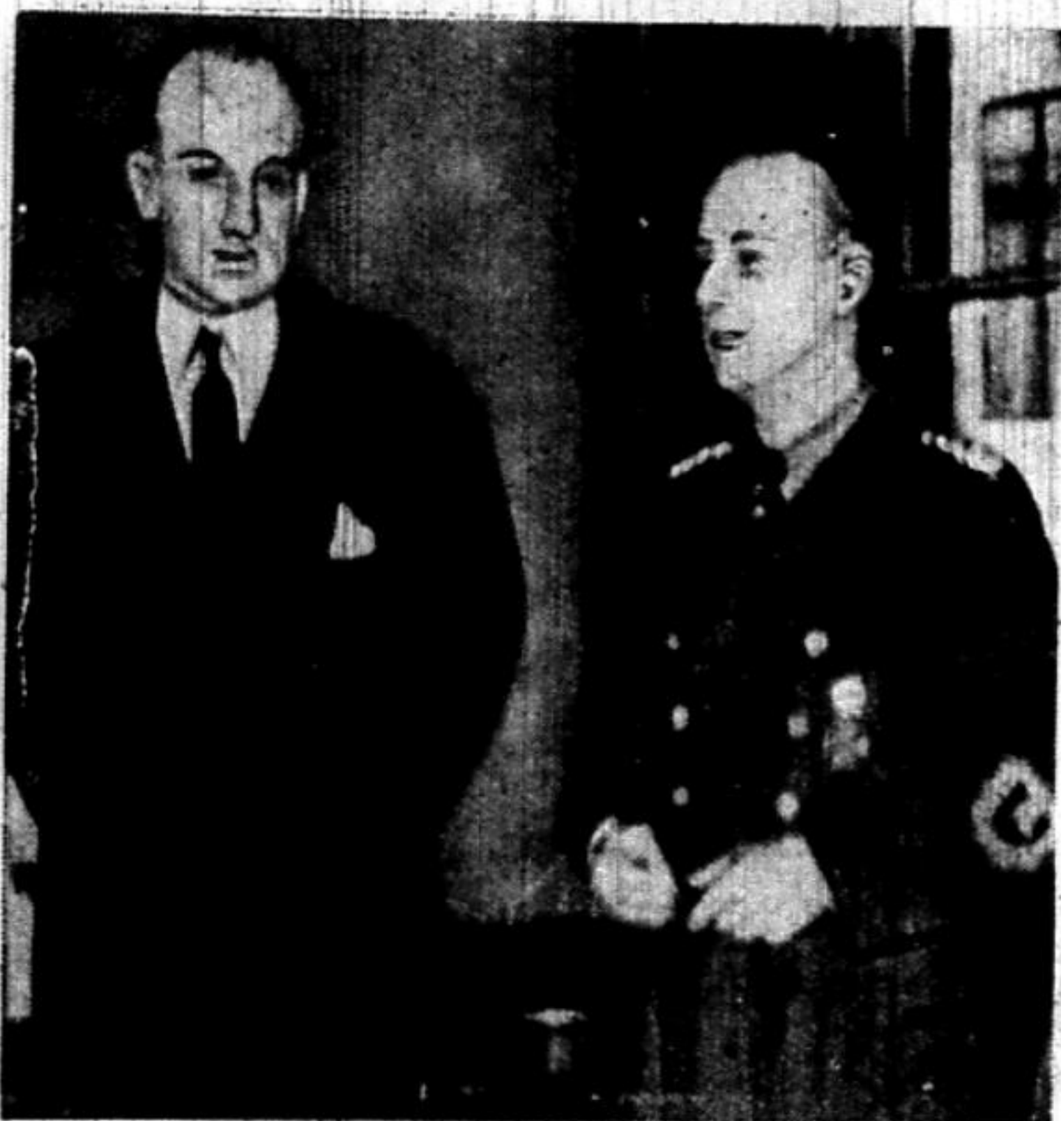
President Roosevelt's peace envoy, SUMNER WELLES is shown above when he met Nazi FOREIGN MINISTER JOACHIM VON RIBBENTROP in Berlin to discuss possible peace proposals.