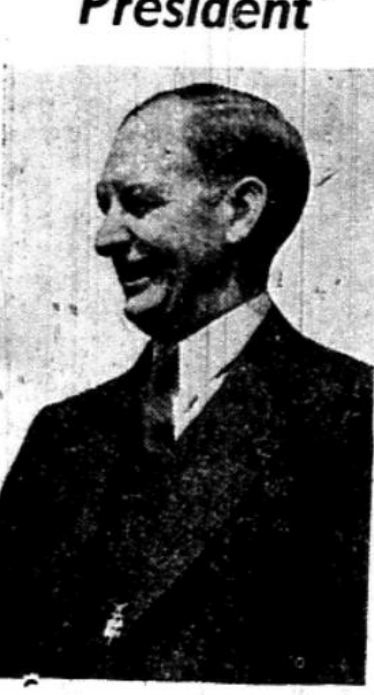
ROBERT GORDON SPROUL