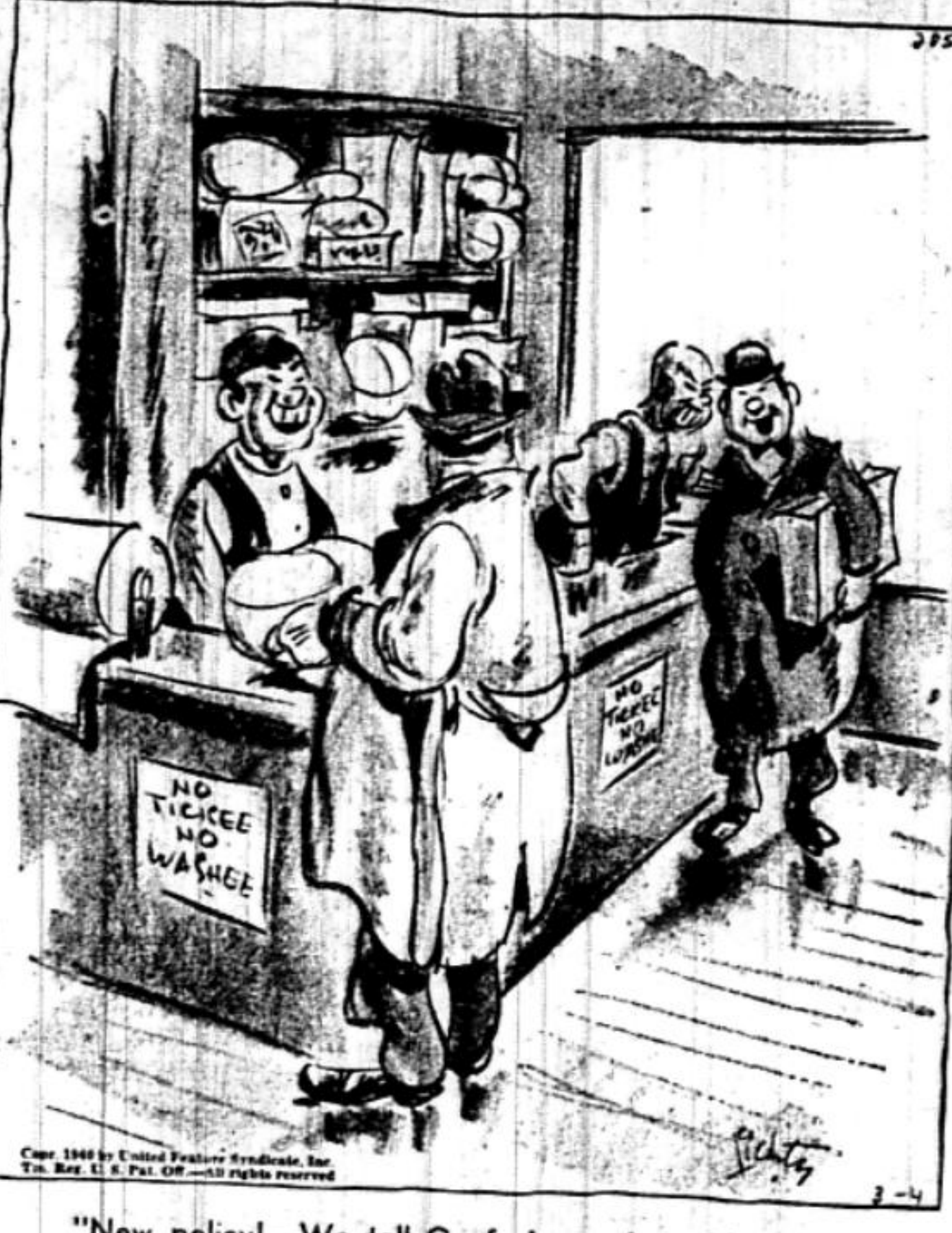
"New policy!—We tell Confucius saying with every laundry bundle over dollar!"