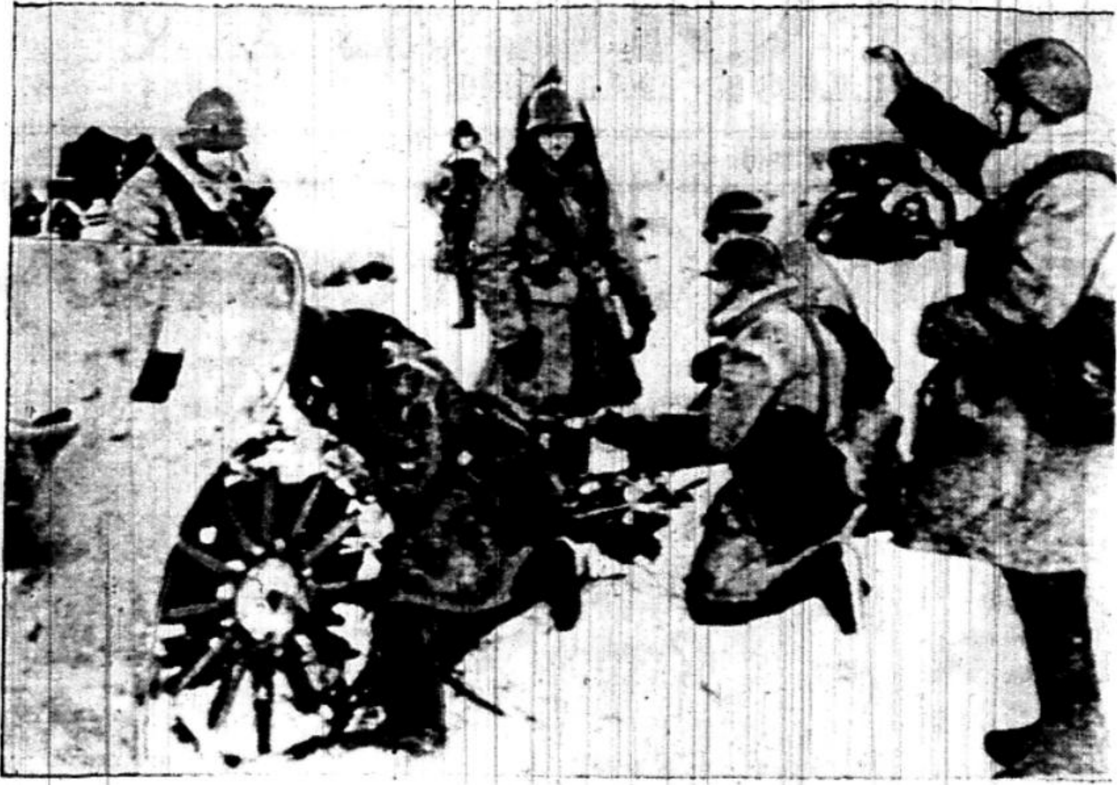
A Russian officer at right directs fire in an attack barrage against the Finnish defenders somewhere on the Finnish front, as Russian infantry units advance slowly into Finland. The picture of Russian troops is one of the first group to pass the censors.