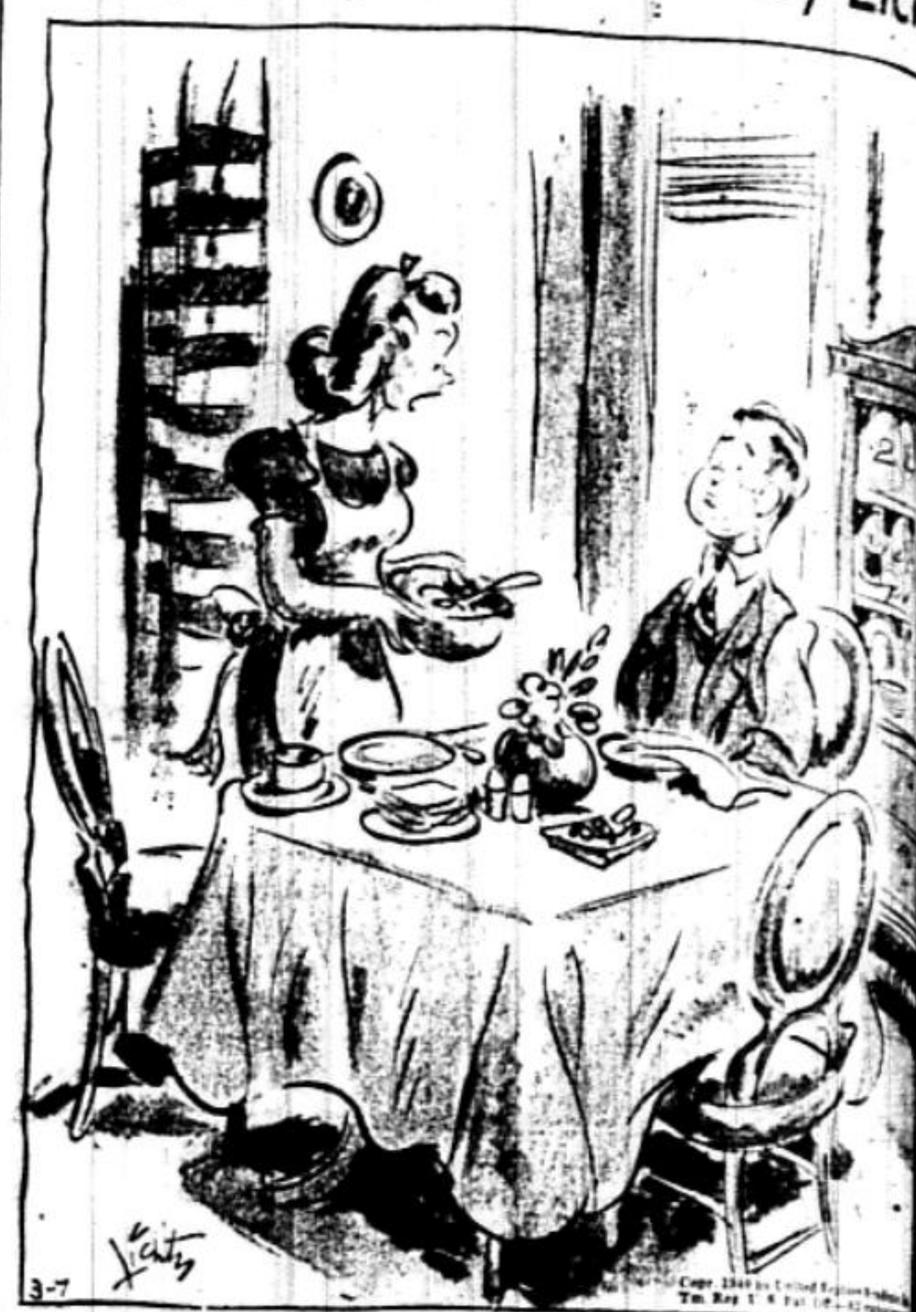
"I enrolled in cooking school, like you said, dear—only trouble they make you eat what you cook!"