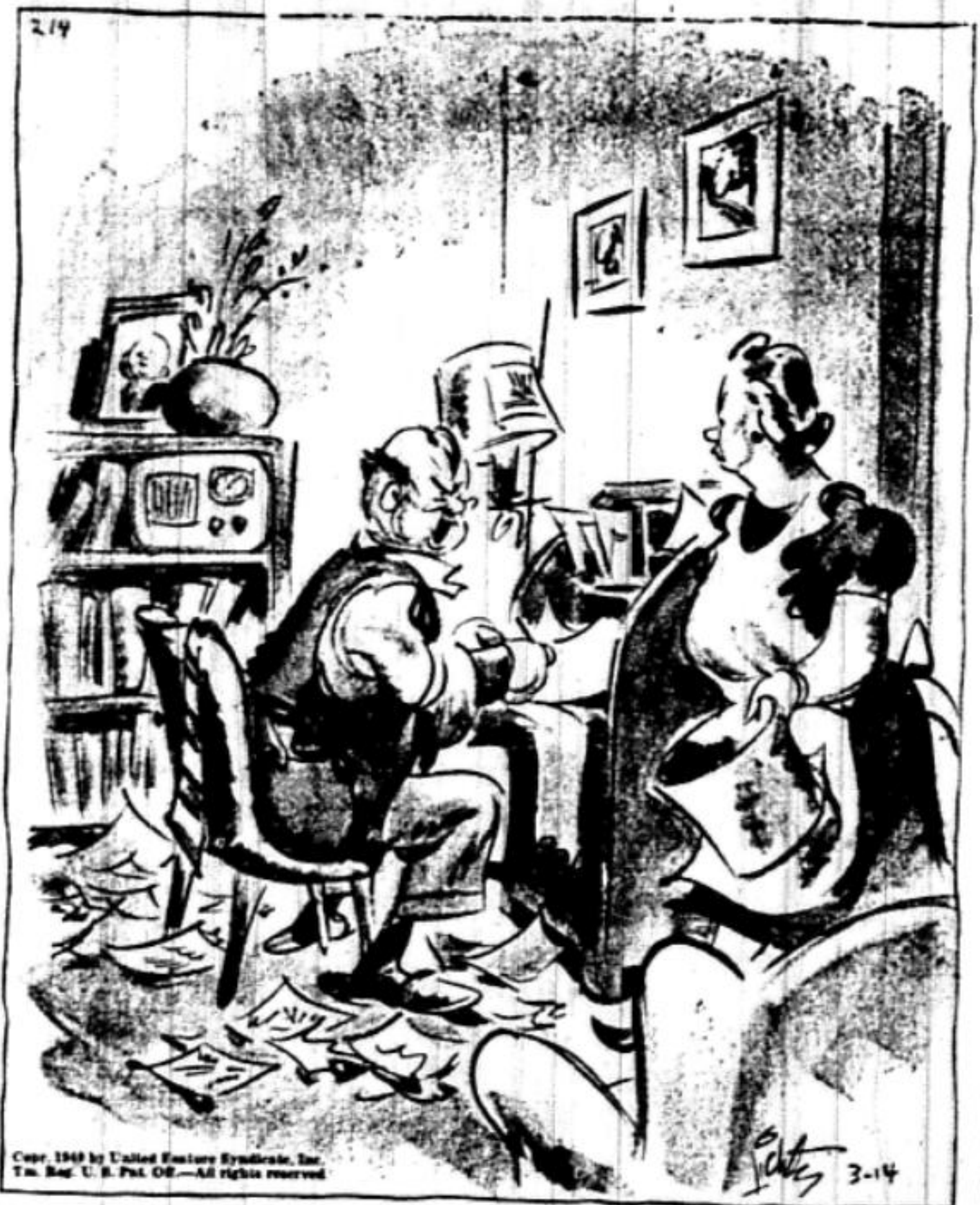
"About that money I lent your folks—shall I deduct it as charity or a bad debt?"