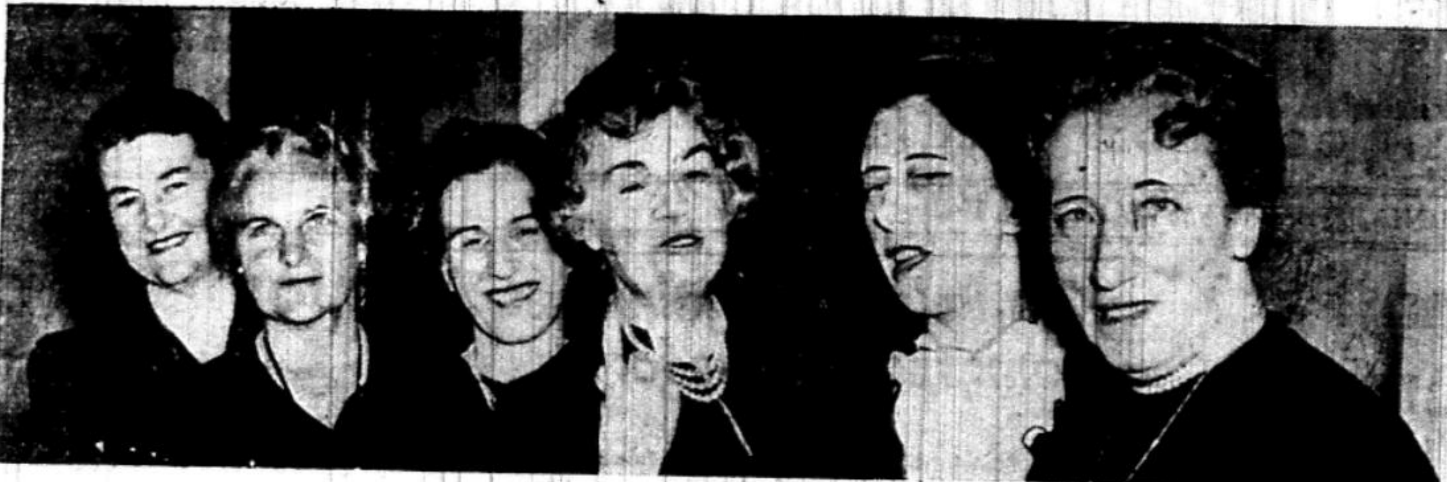
Congress' "Peticoat Front", women representatives, gathered on Capitol Hill to welcome a new member to their ranks, one Frances Bolton from Ohio. Legislature's ladies are (left to right): REPRESENTATIVES MARY T. NORTON (D., N. J.), FRANCES BOLTON (R., O.), CLARA McMILLAN (D., S. C.), EDITH ROGERS (D., Mass.), JESSIE SUMNER (D., Ill.), and CAROLINE O'DAY (D., N. Y.).