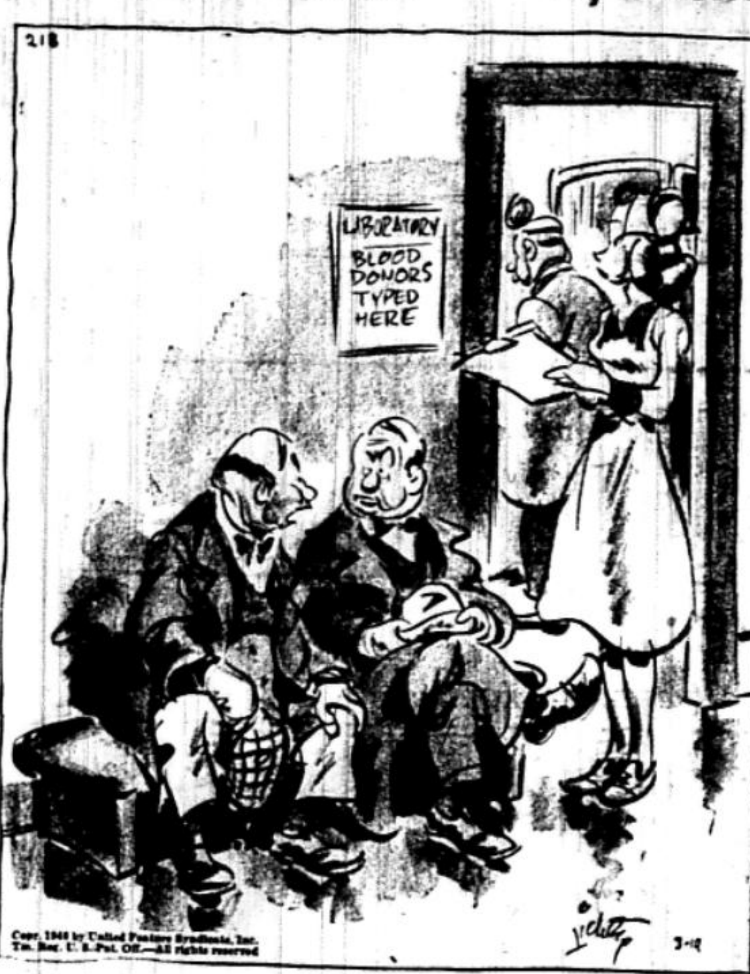
—so I says to my landlady: 'How you gonna make me pay—can you squeeze blood outa a turnip?'