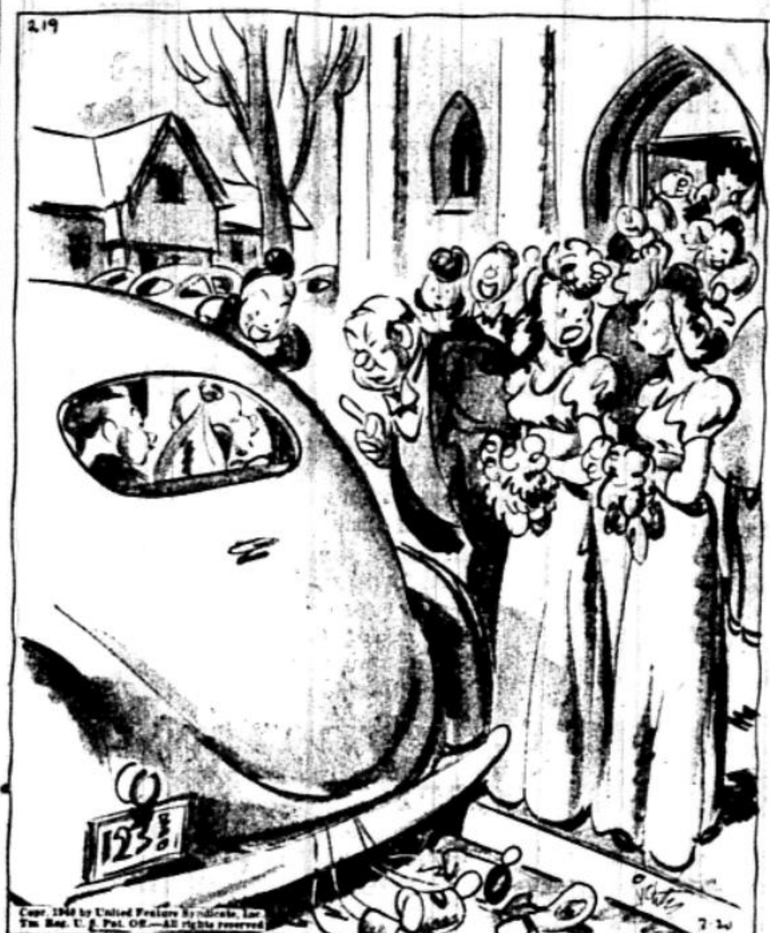
"How she got a man is beyond me! Why, she hasn't even got a job!"

Tickets for the boxing matches at 8 p.m. today in the Gymnasium will go on sale at 6:30 p.m. at the box office at the gymnasium.