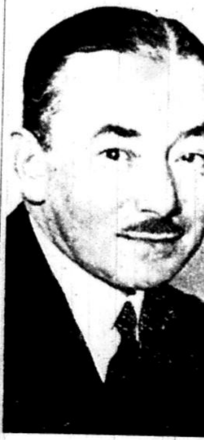
PAUL REYNAUD, who became French premier on the resignation of Edouard Daladier, has a long-time reputation of being a bitter foe of Nazism.