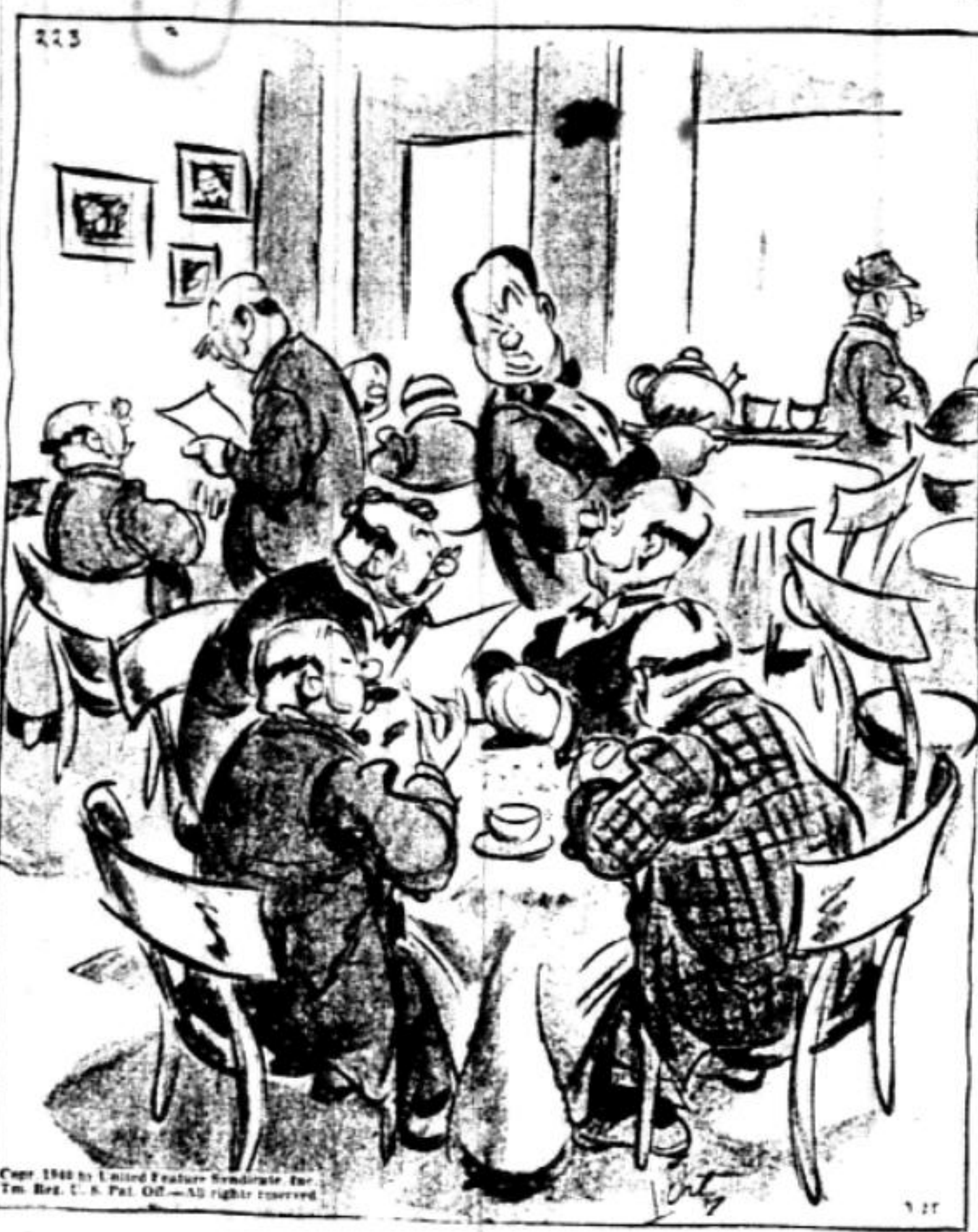
"Never mind the waiter—he's overheard so many of our deals, our company made him a vice-president!"