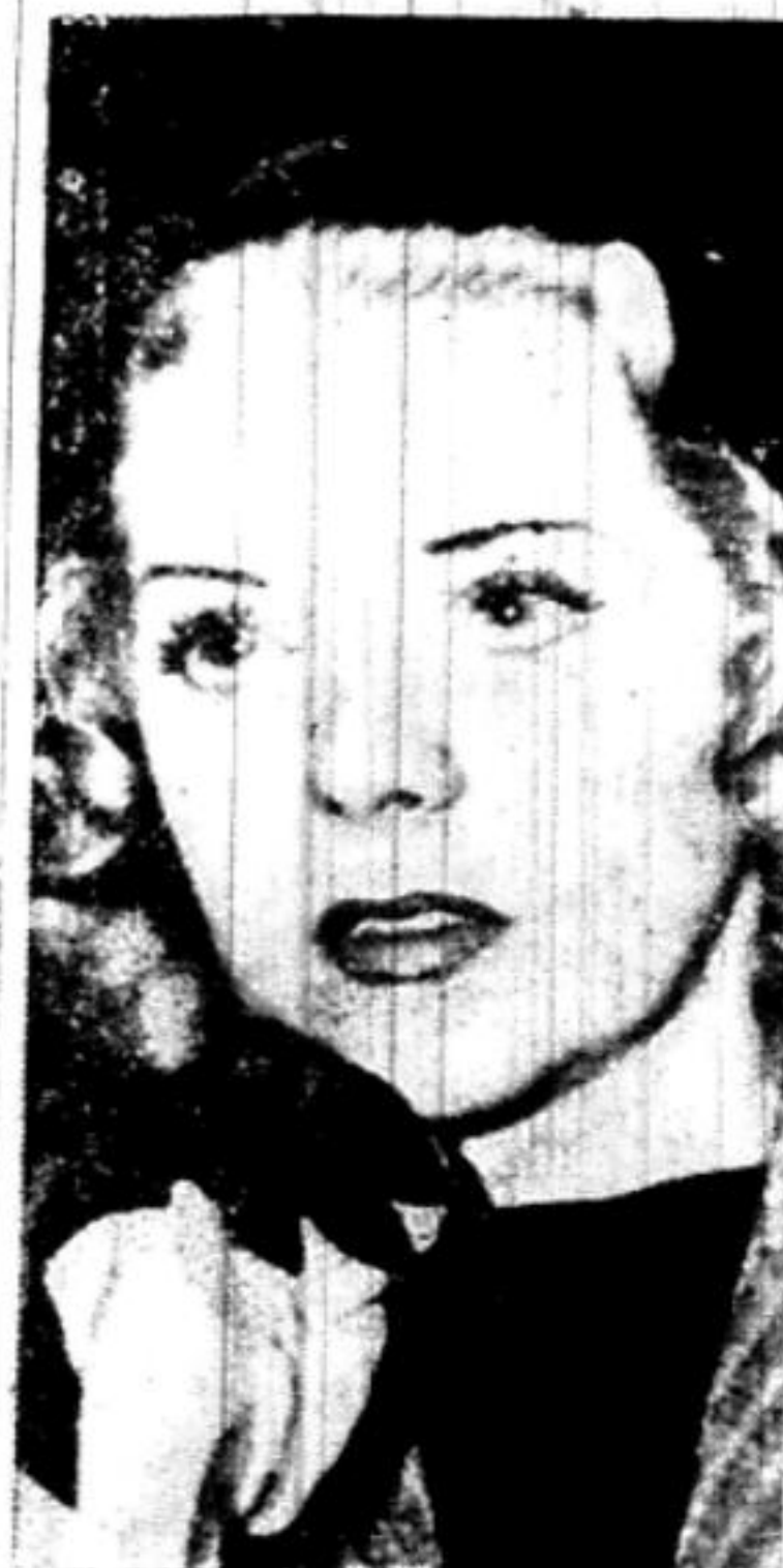
ALICE FAYE, above, is shown on the witness stand of a Hollywood courtroom as she seeks a divorce from her singer-husband, Tony Martin.