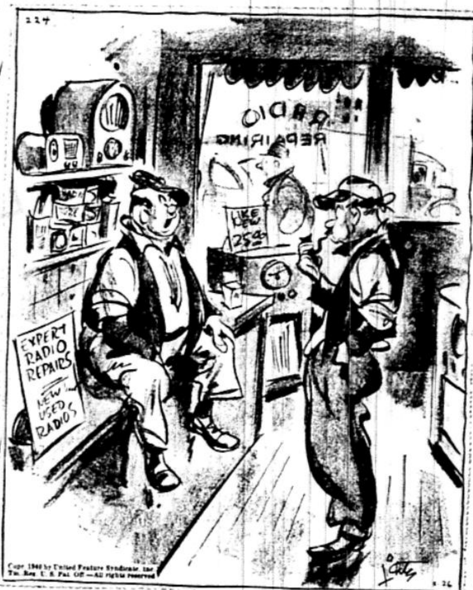
"You gotta expect this slump, Gus—you can't expect people to bother about repairin' their sets till after the primaries!"