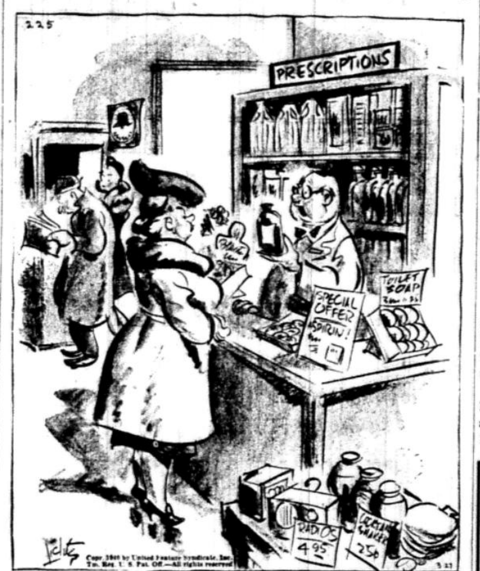
"Is it good? Why, this tonic started with a small local radio program and today it's on the big network with an 87-piece symphony, two sopranos and a baritone!"