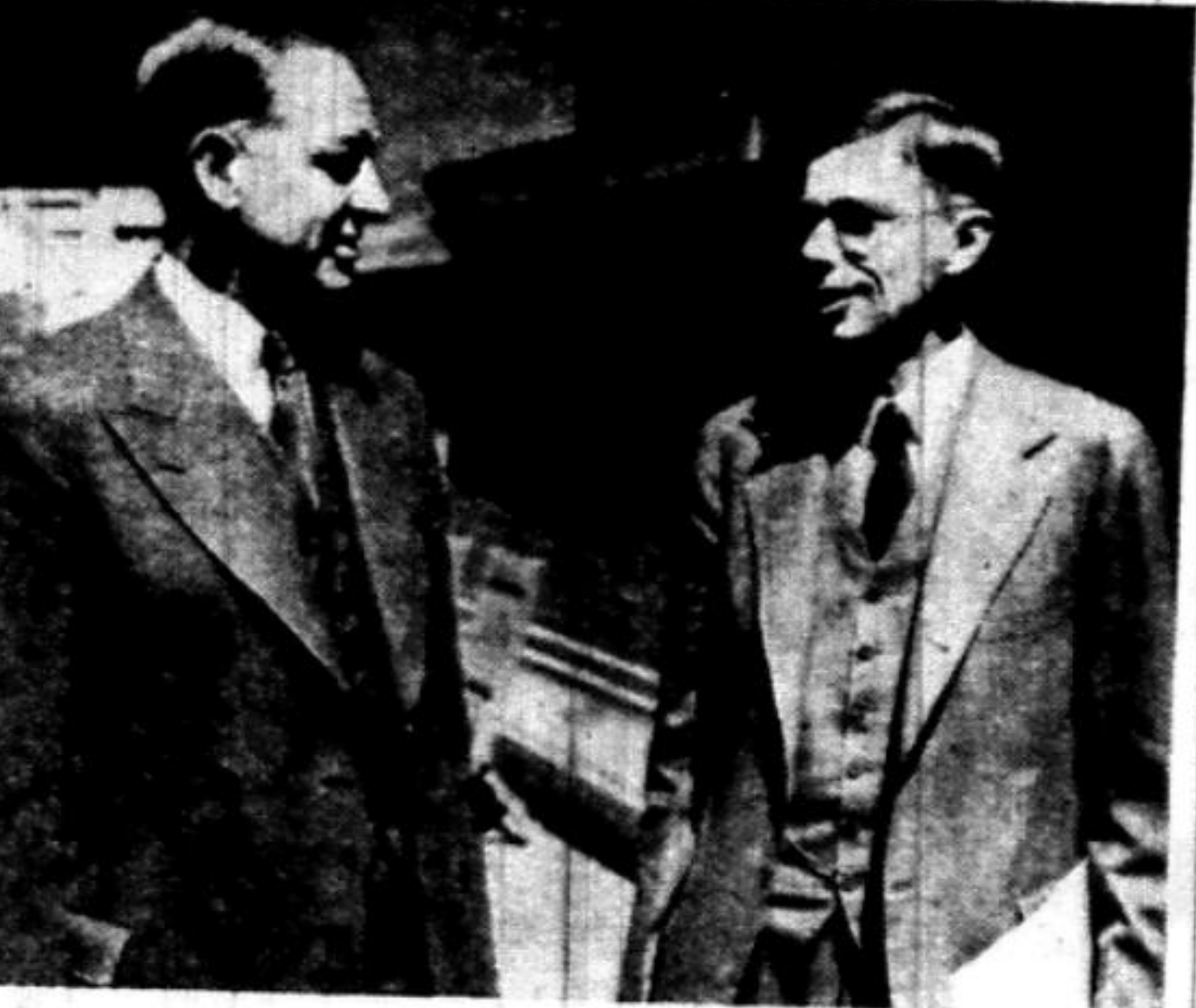
PRESIDENT ROBERT GORDON SPROUL, left, is shown greeting JAMES CONANT, president of Harvard, who the latter spoke at the University in September, 1937. Conant will be the main speaker at the annual Charter Day exercises tomorrow.