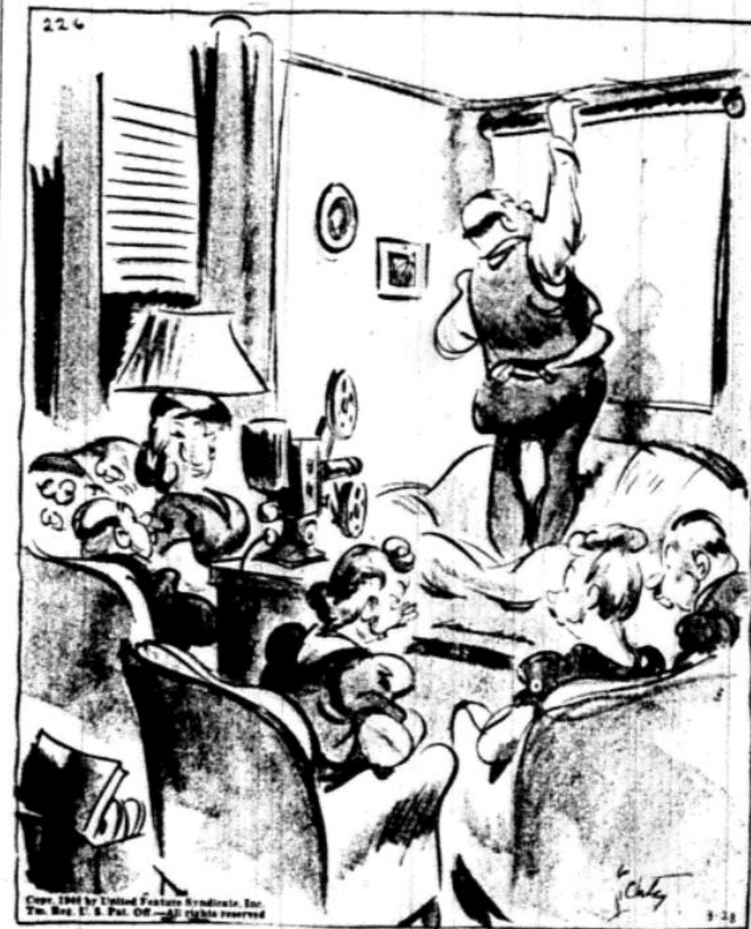
"We don't ask Mrs. Snodgrass to our movies any more, since she appointed herself neighborhood censor!"