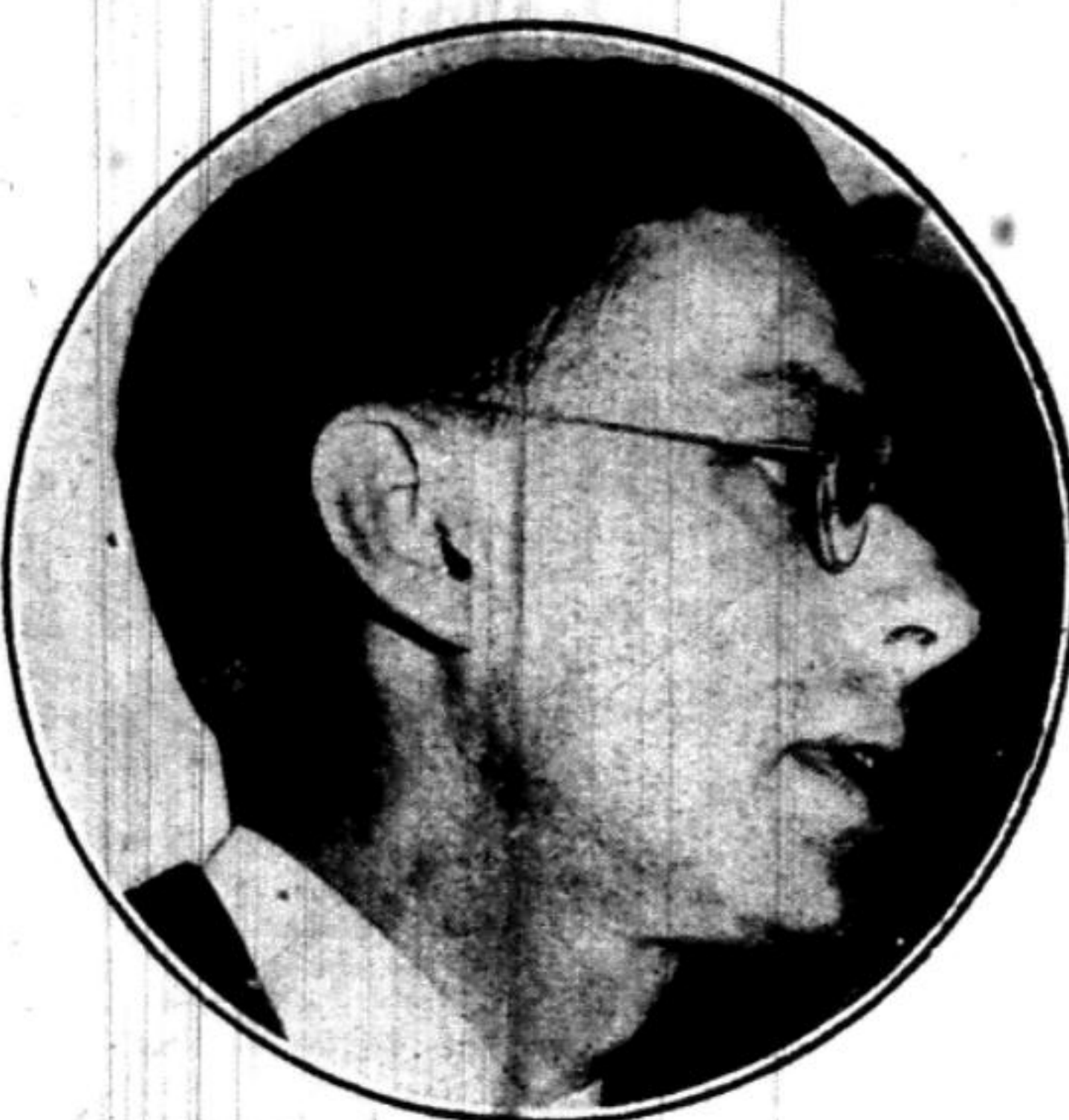
DR. JAMES BRYANT CONANT

Two great American universities, one more than three centuries old, one founded but 72 years ago, will be joined today when Dr. James Bryant Conant, president of Harvard University, delivers the University's Charter Day address in the Greek Theatre.