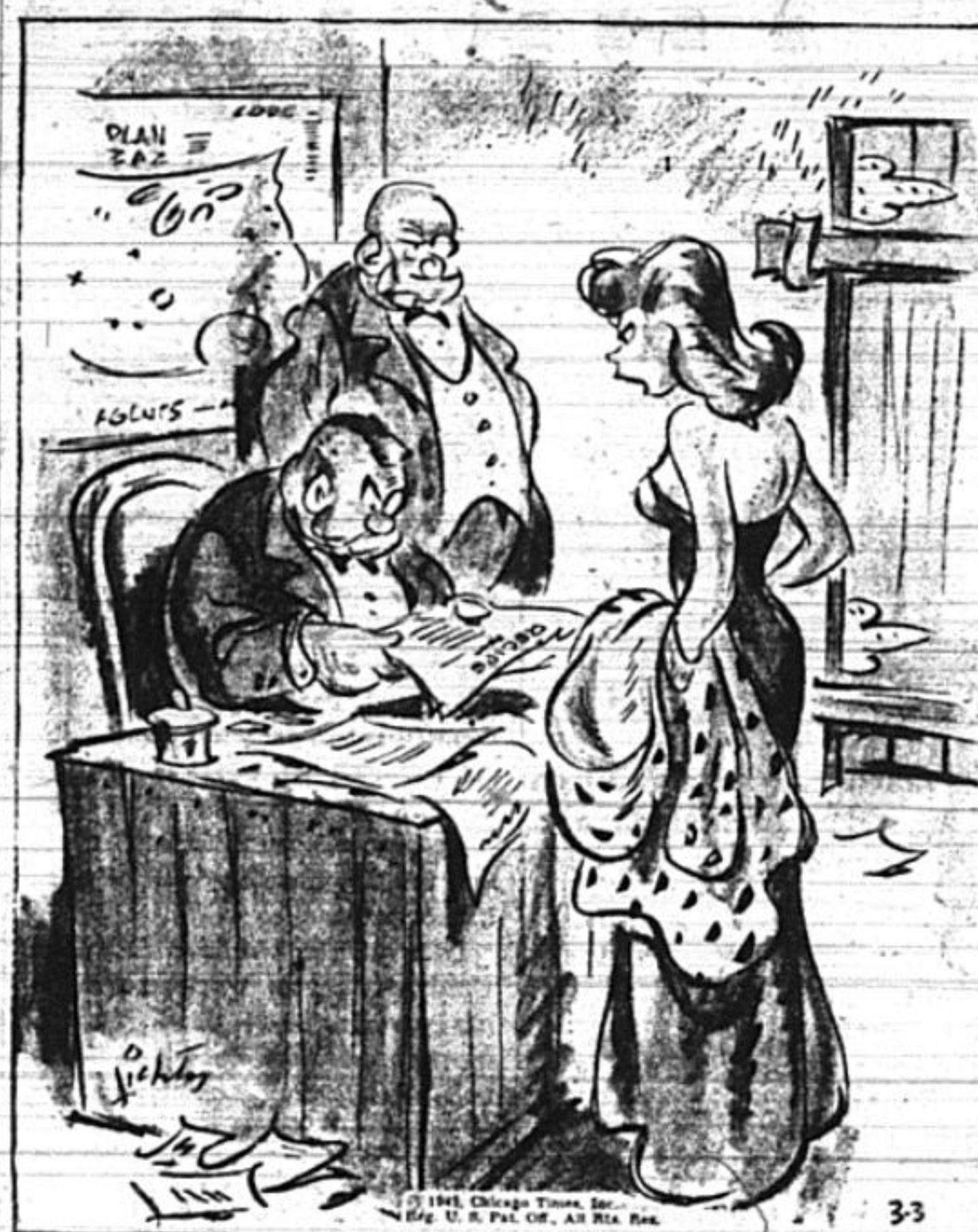
"How was I to know he was a mess officer—I work on him all evening and all I get is the plans and recipes for feeding 35,000 men!"