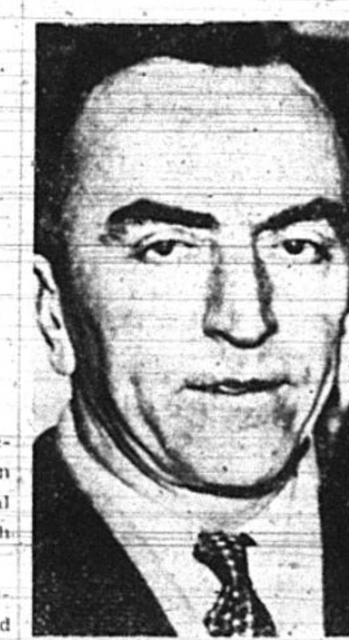
CAPTAIN EDDIE RICKENBACKER may lose the sight of one eye as the result of his recent plane accident. See page 2 for a map of the crash area.